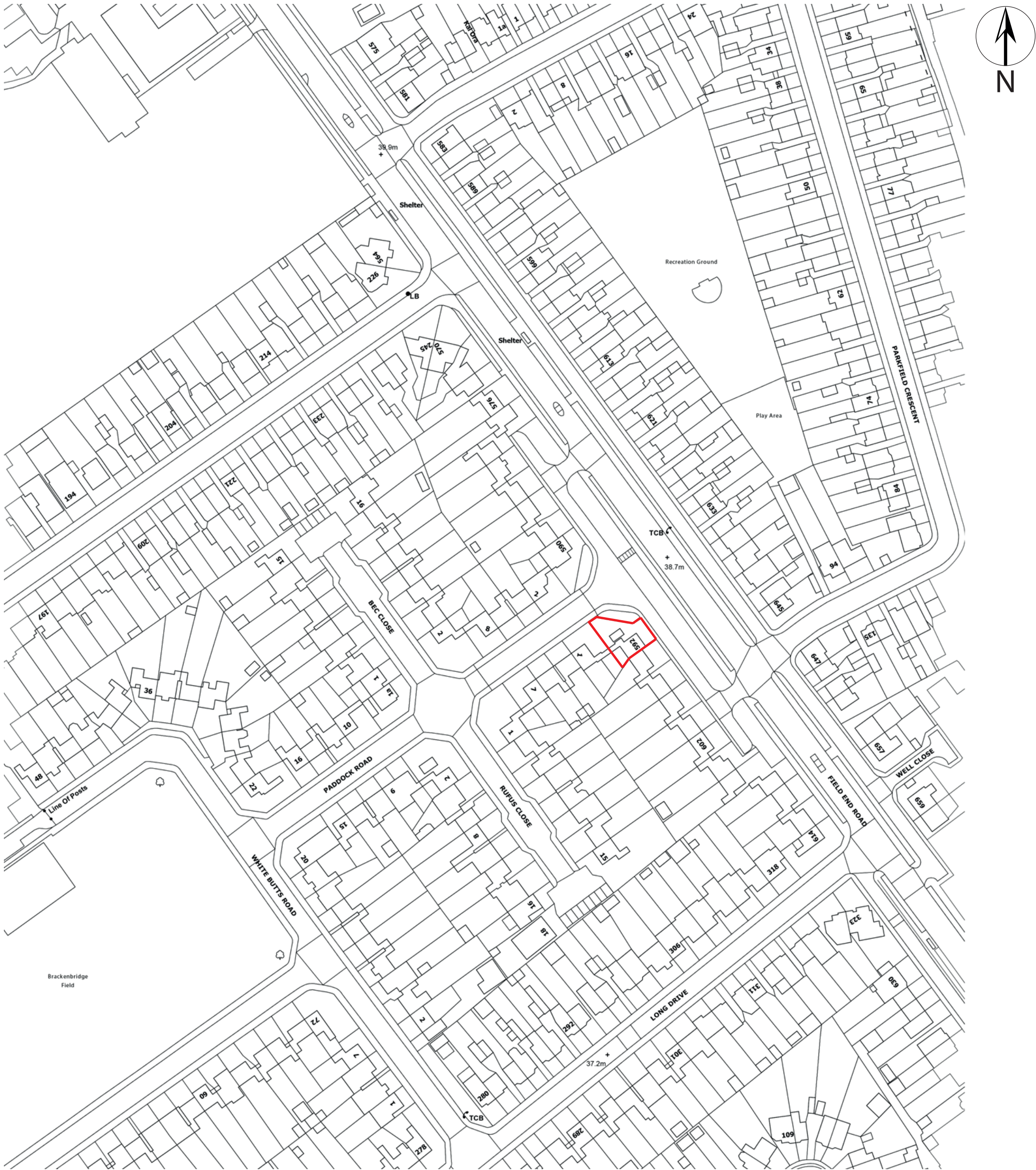
SITE LOCATION PLAN SCALE 1:1250 SITE BOUNDRY :