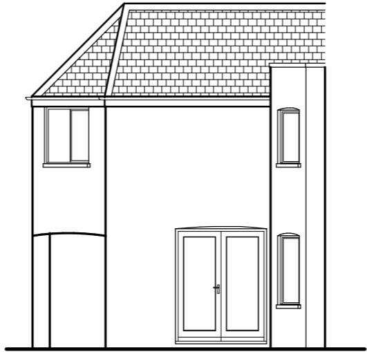
Proposed Left Side Elevation

These plans have been produced to a recognized scale and a standard paper size, both shown in the title block. If you have received this drawing as a pdf or similar file type, please check when printing that you have an accurately sized drawing using the scale bar provided.