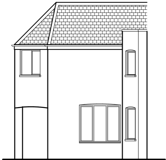
Existing Left Side Elevation