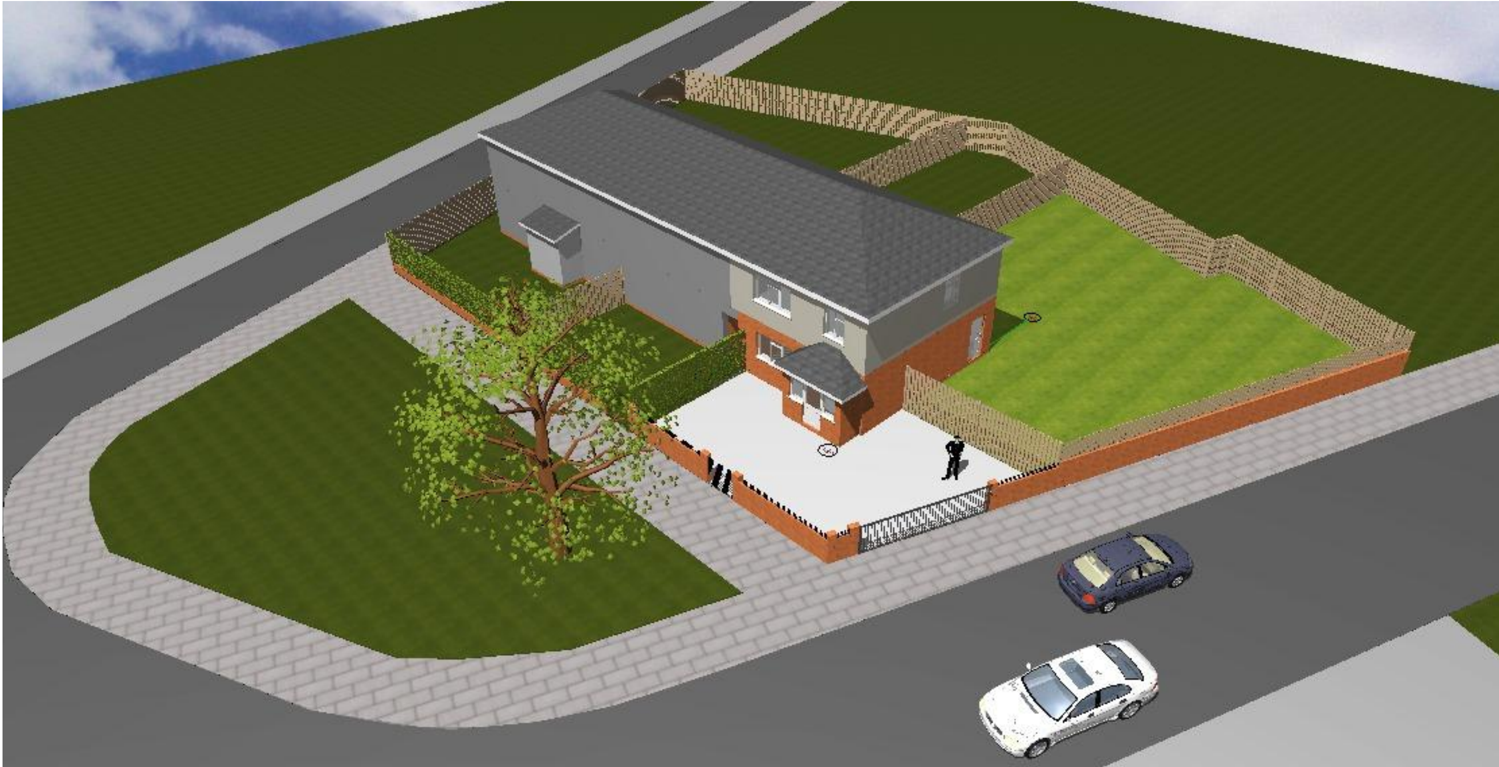
TOP VIEW OF THE PROPERTY AFTER CHANGES