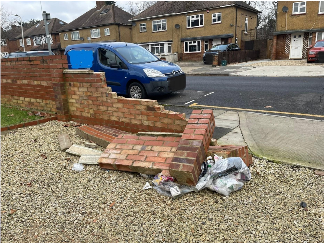
FRONT ELEVATION BEFORE RENOVATION