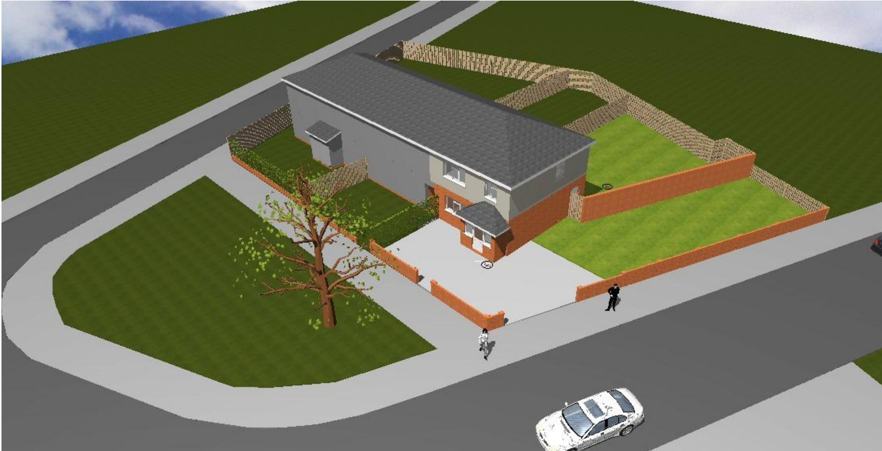
TOP VIEW OF THE PROPERTY BEFORE CHANGES