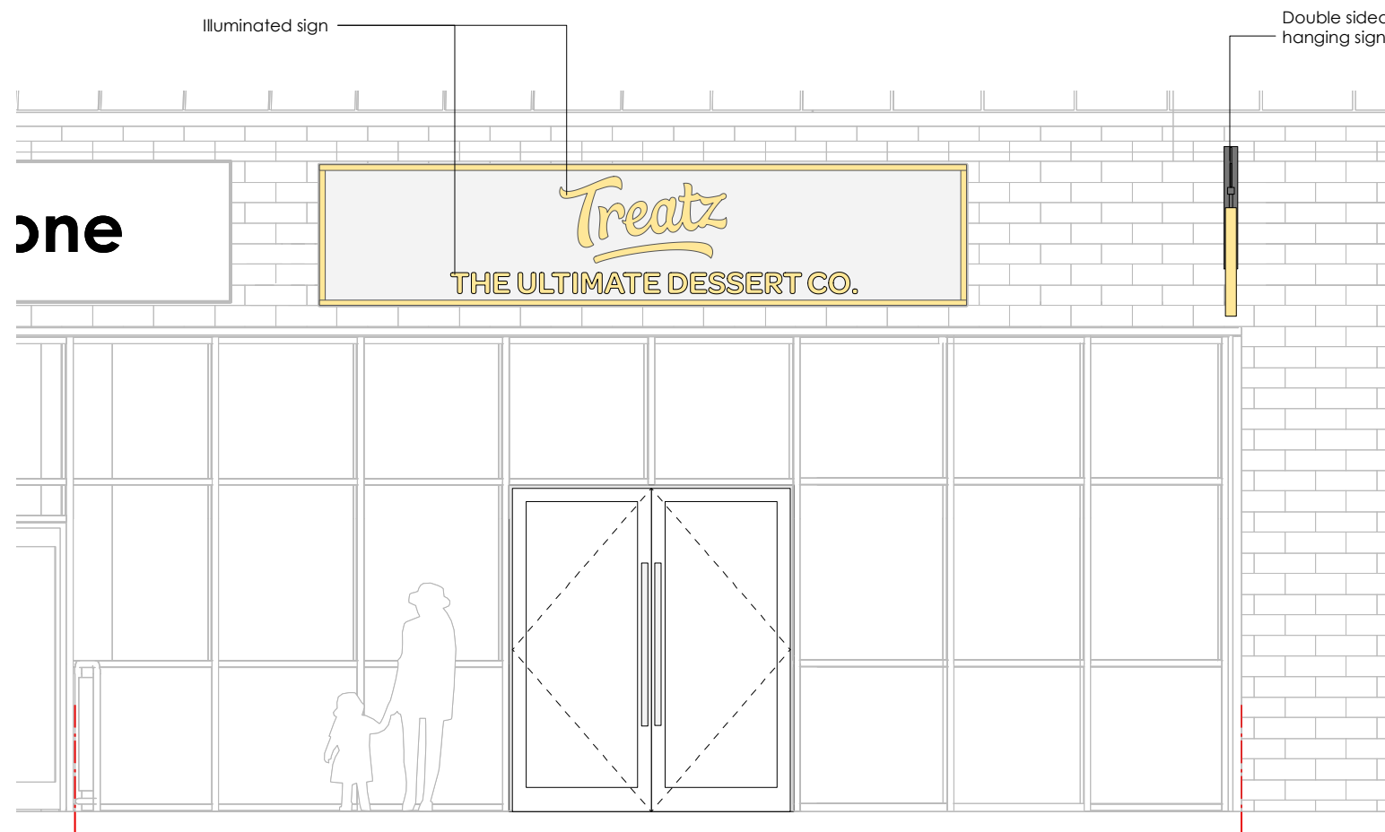
3 Proposed Front Elevation 1:50 @ A3