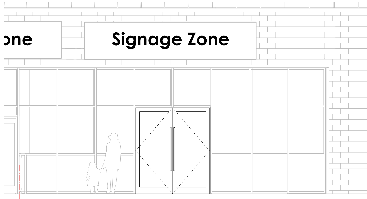
1 Existing Front Elevation 1:50 @ A3