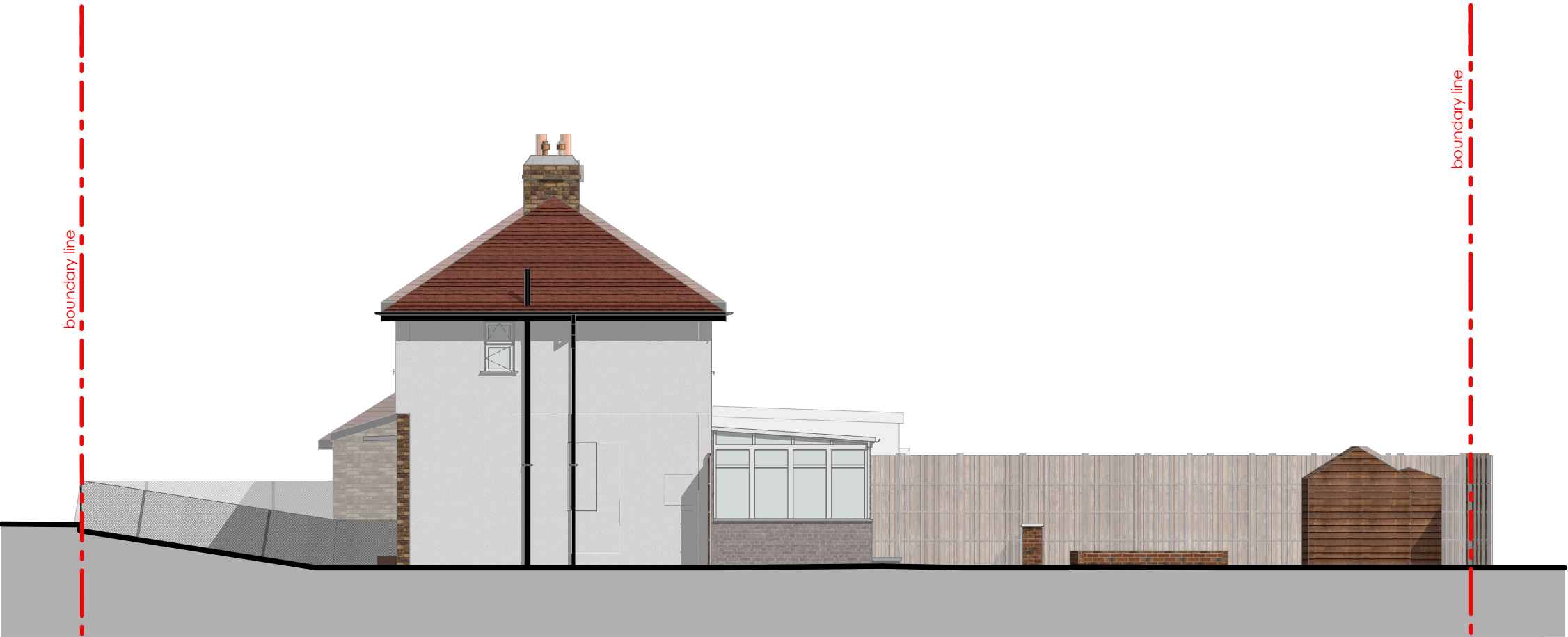
Northwest Elevation 1:100