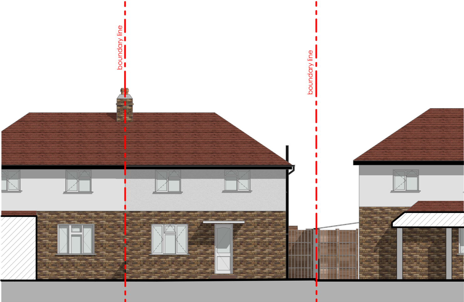
Northeast Elevation 1:100