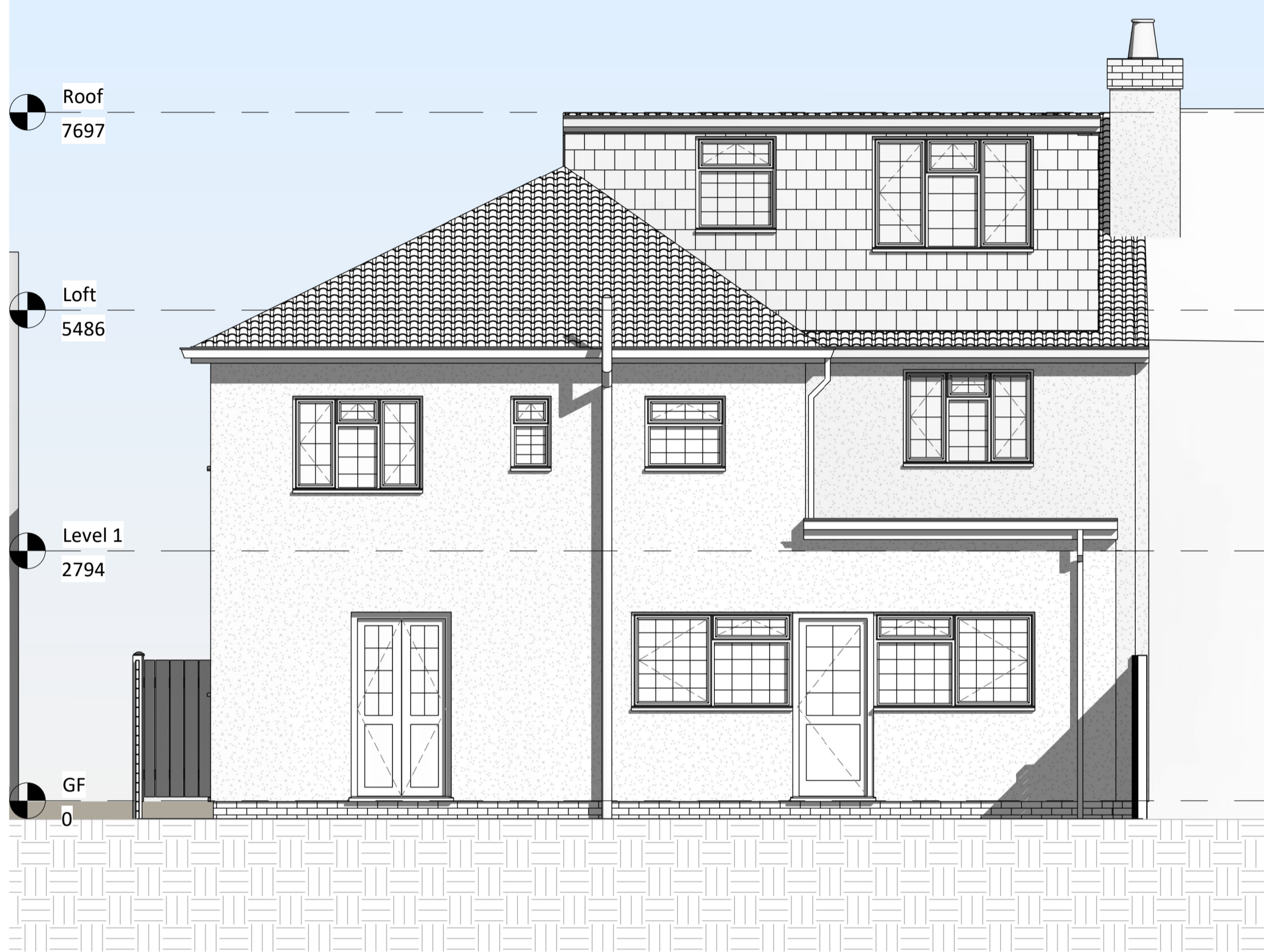
2 Existing South East Elevation 1 : 50