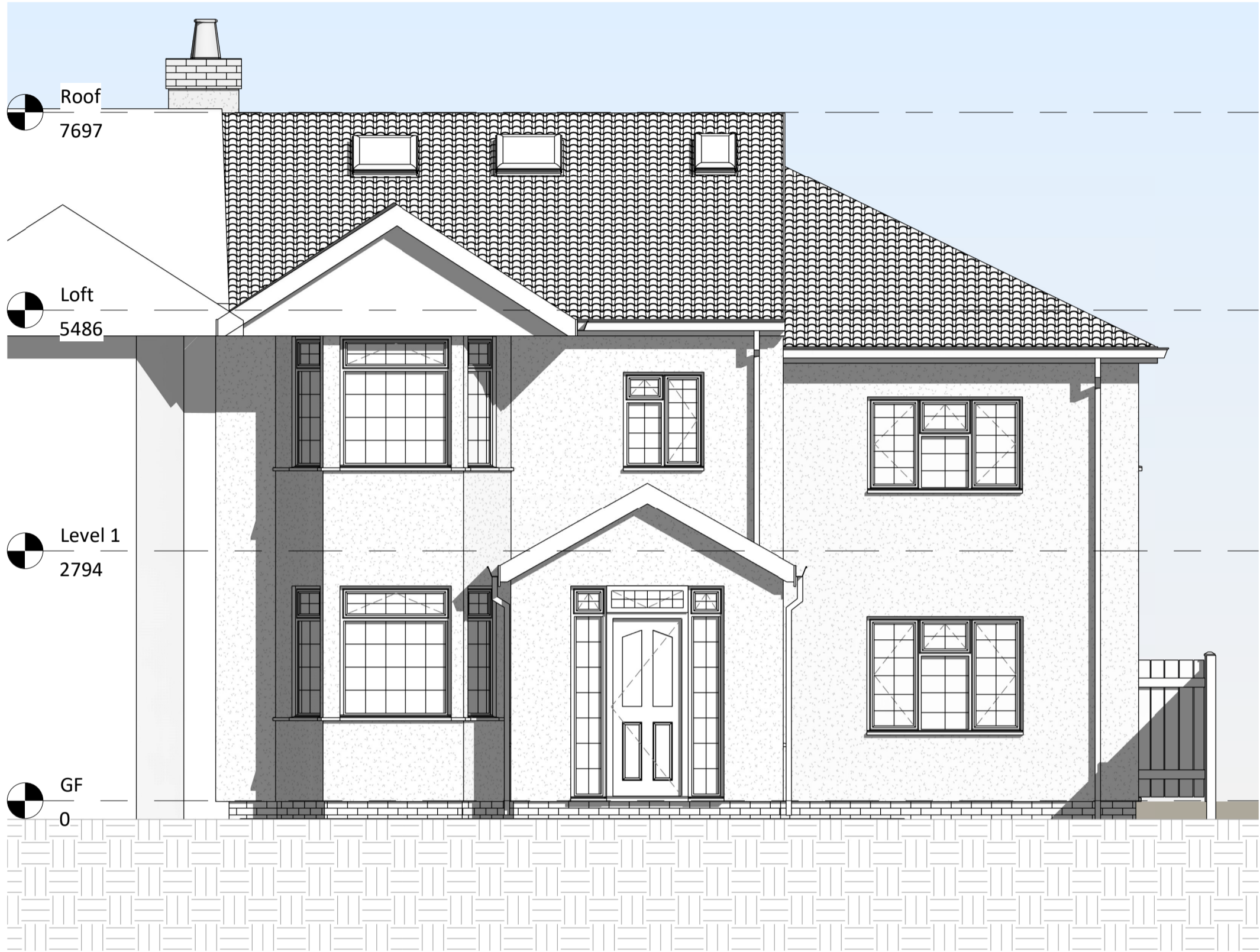
1 Existing North West Elevation 1 : 50