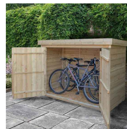
PICTURE OF CYCLE SHED