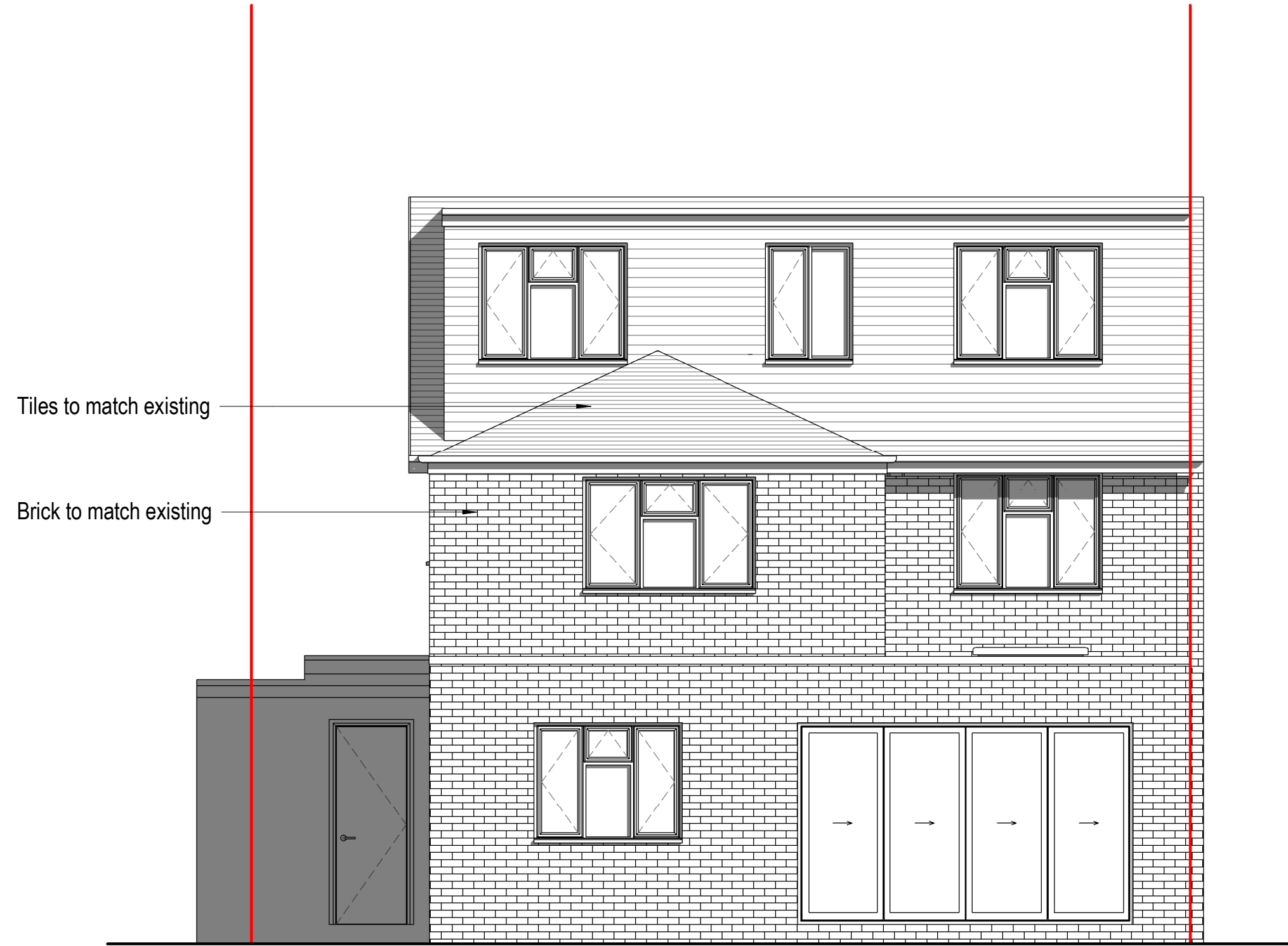
2 North_Proposed 1 : 50