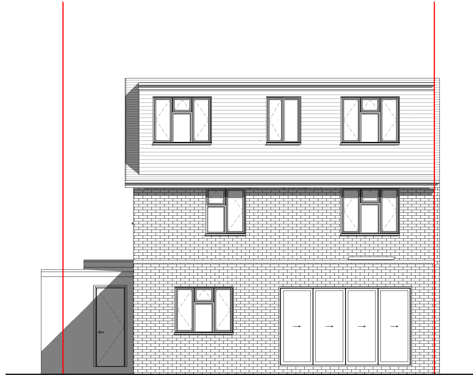
2 North 1 : 50