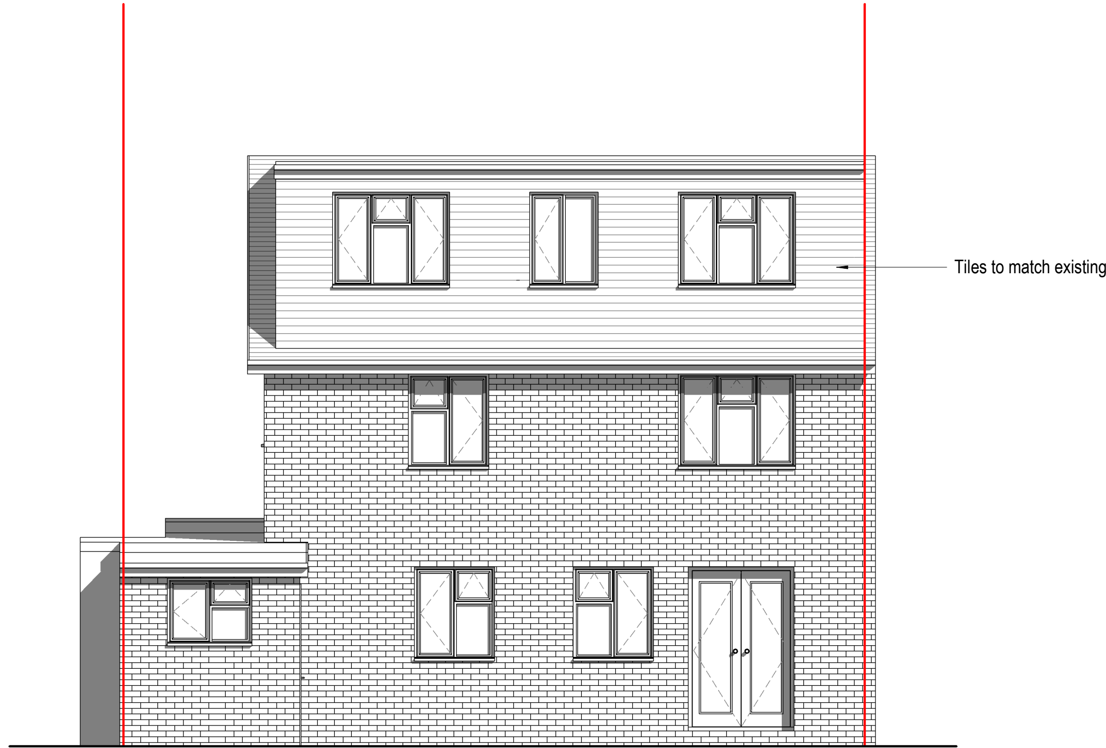
2 North_Proposed 1 : 50