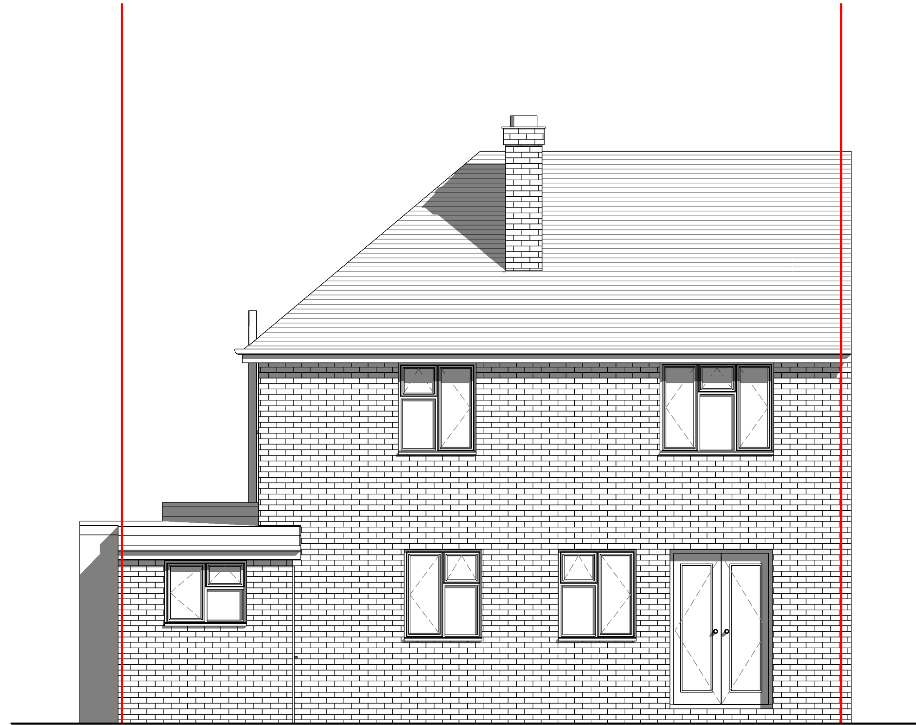
2 North 1 : 50