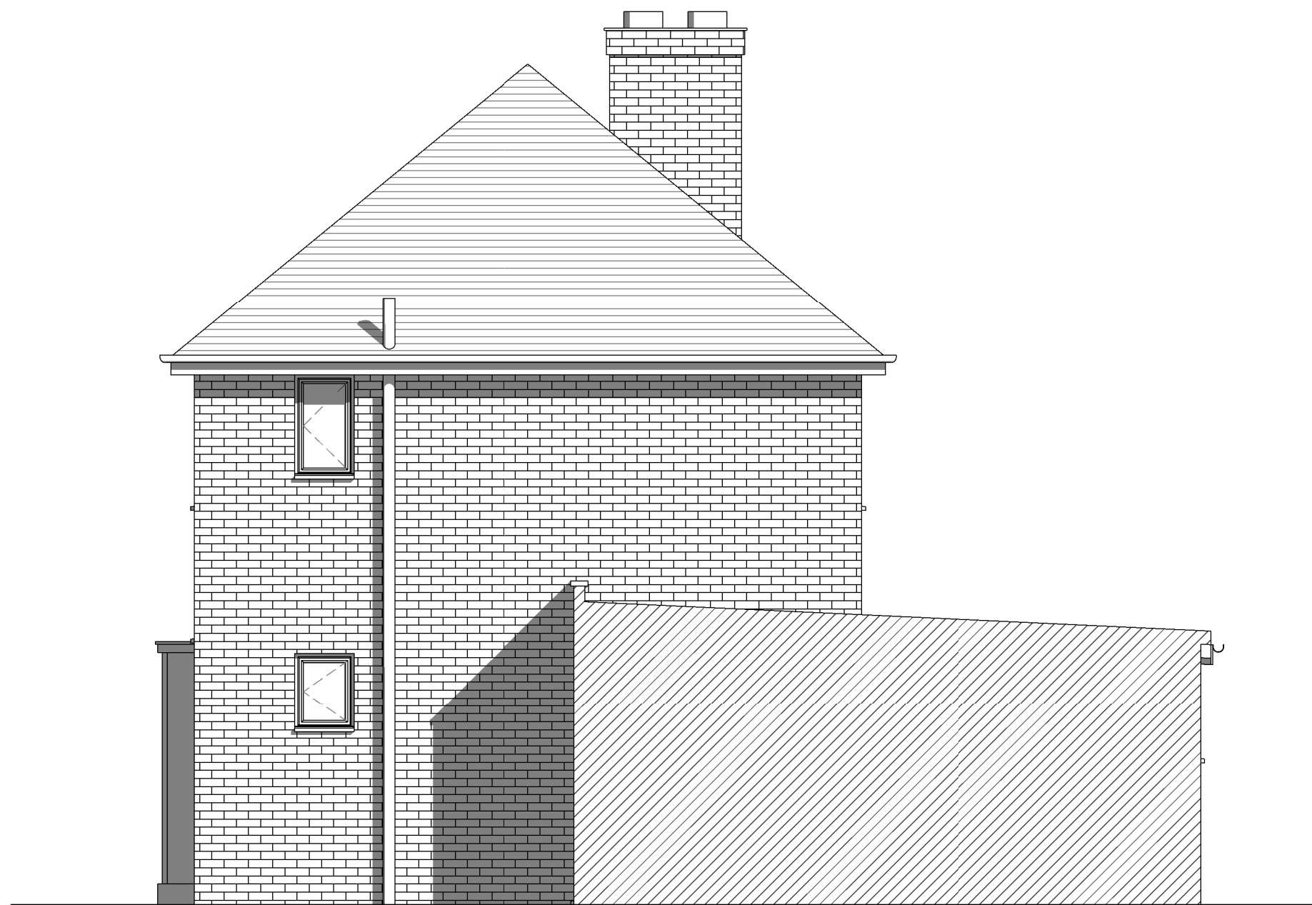
3 East 1 : 50