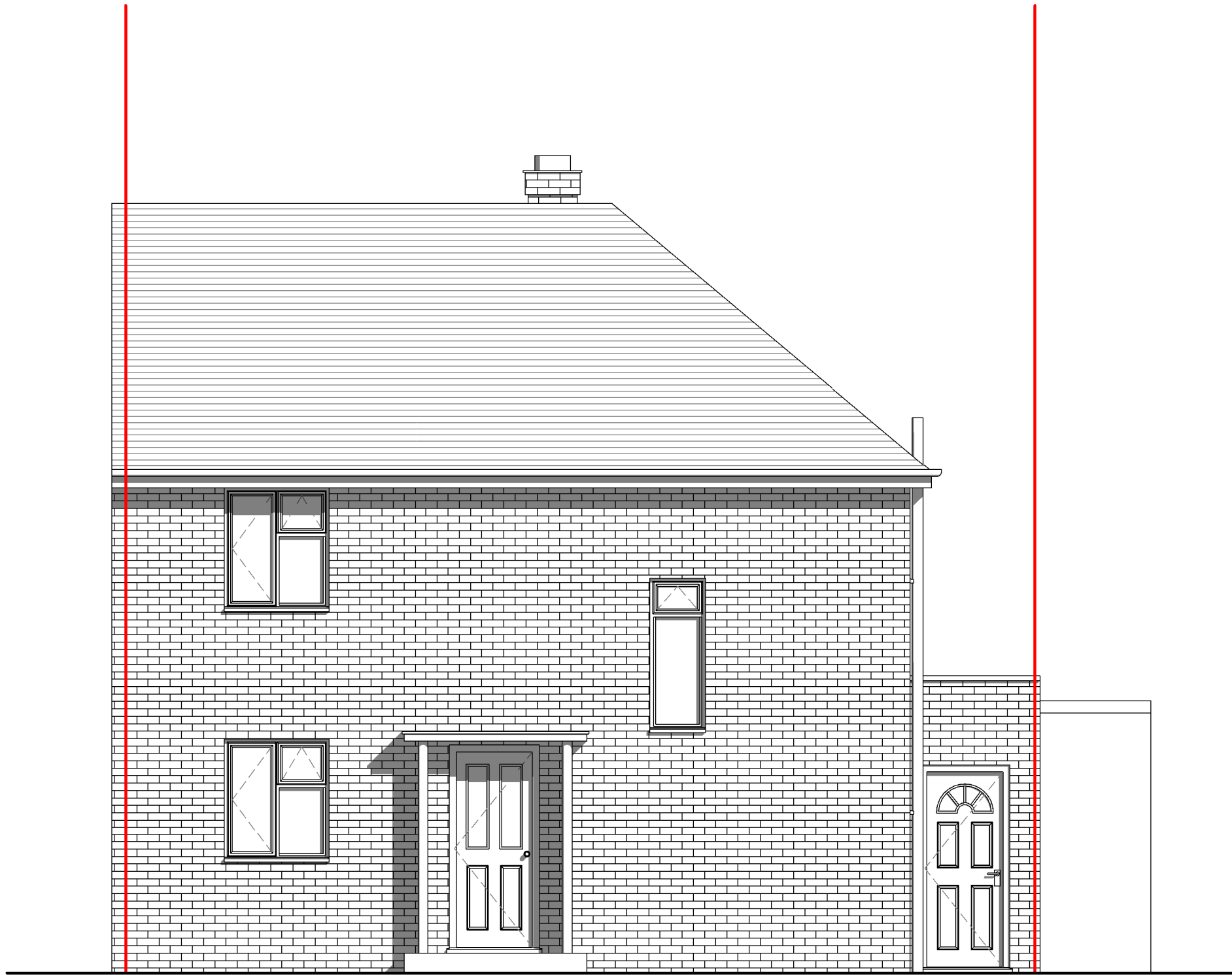
1 South 1 : 50