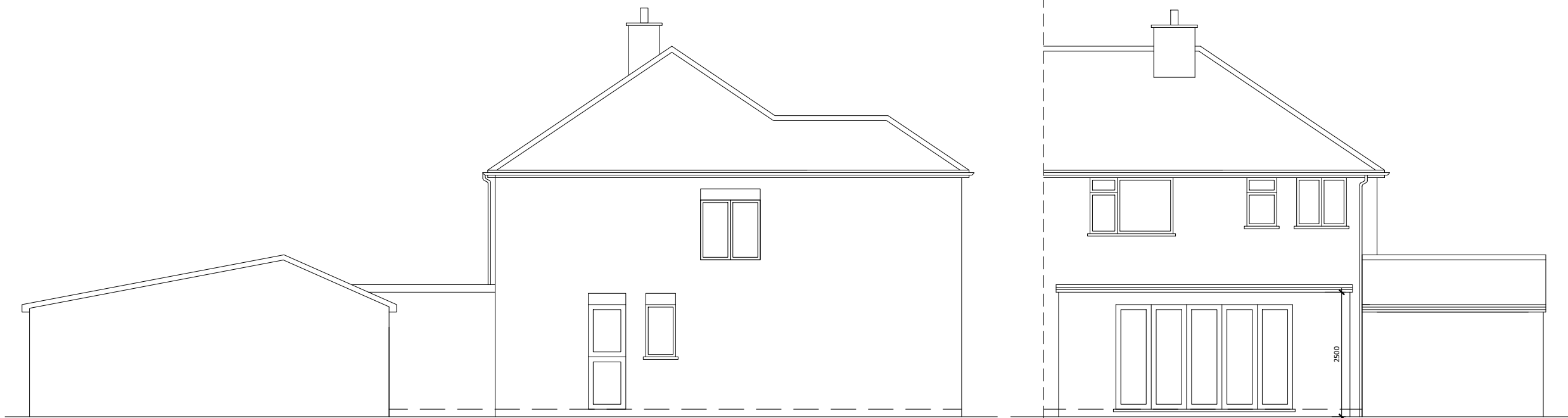
21 | PROPOSED SIDE ELEVATION SCALE 1:100

NOTE: ALL MATERIALS TO MATCH EXISTING DWELLING