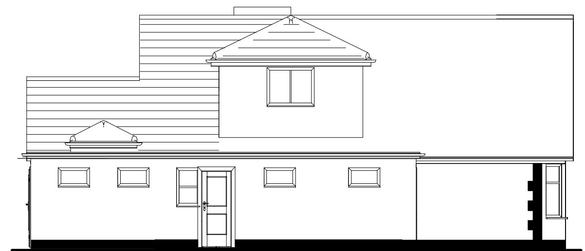
PROPOSED LEFT HAND SIDE ELEVATION