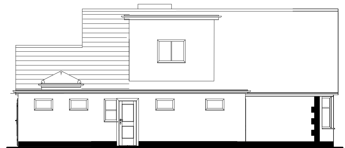
PROPOSED LEFT HAND SIDE ELEVATION