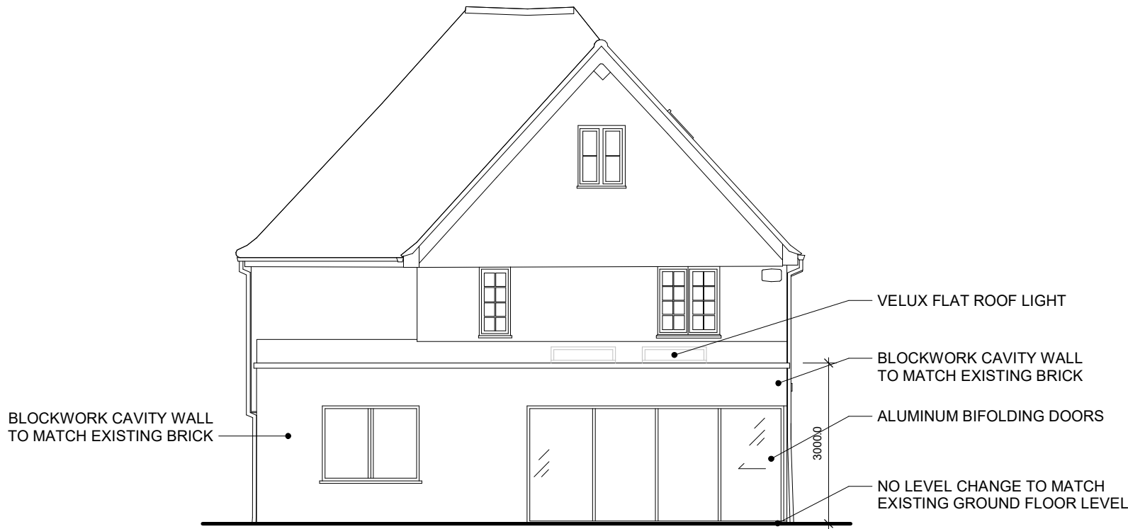
1 PROPOSED REAR ELEVATION 1 : 100