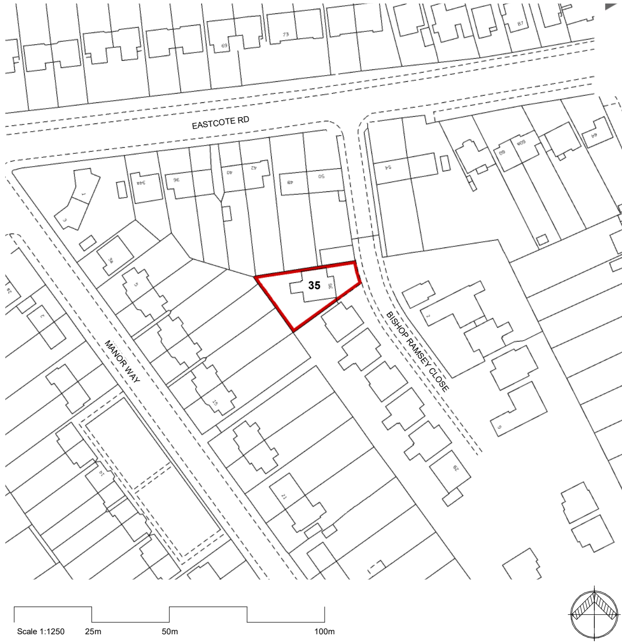
1 Location Plan 1 : 1250