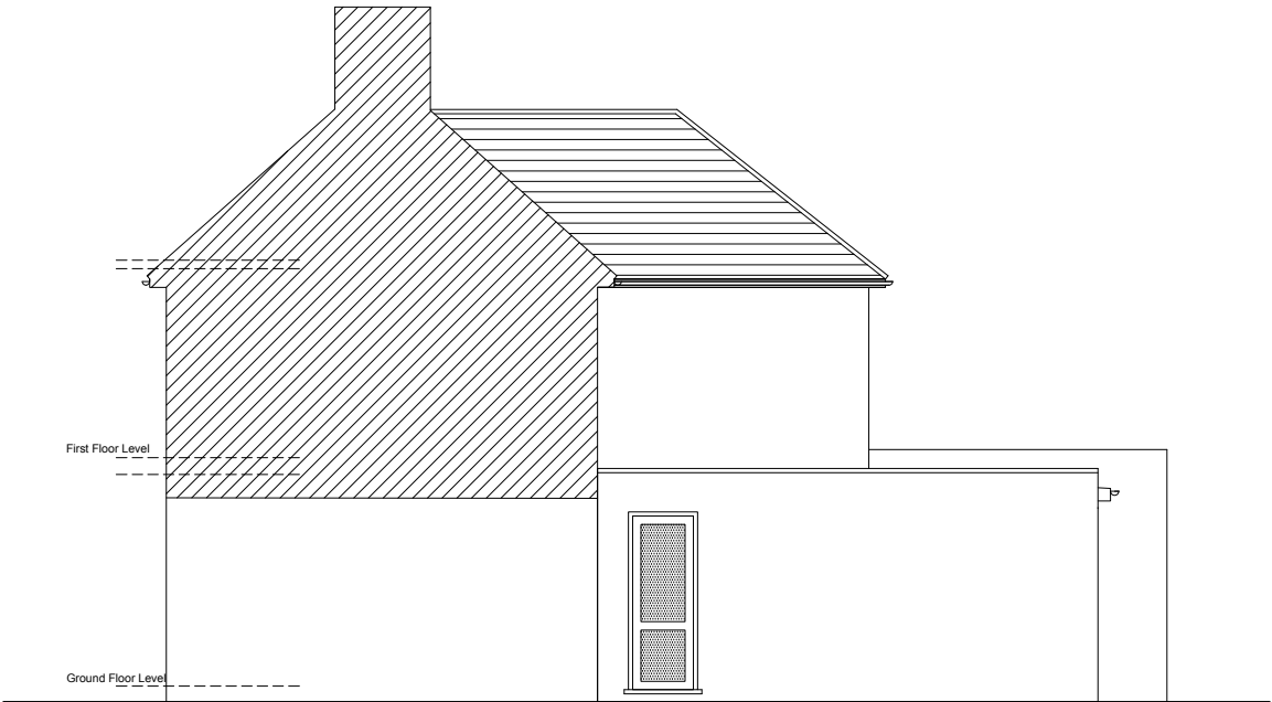
Existing Left Side Elevation