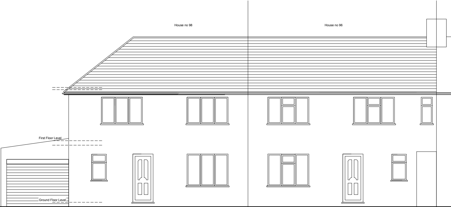
Existing Front Elevation (No Change)