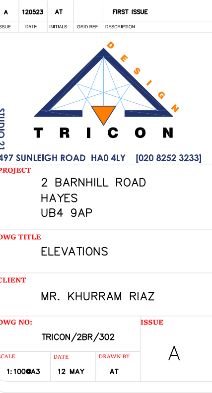
EXISTING SIDE ELEVATION-2