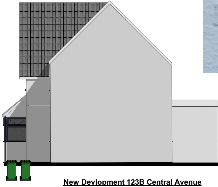
2 - Proposed Side Elevation 1:100