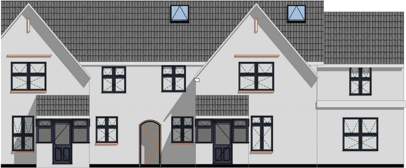
1 Existing Front Elevation 1:100