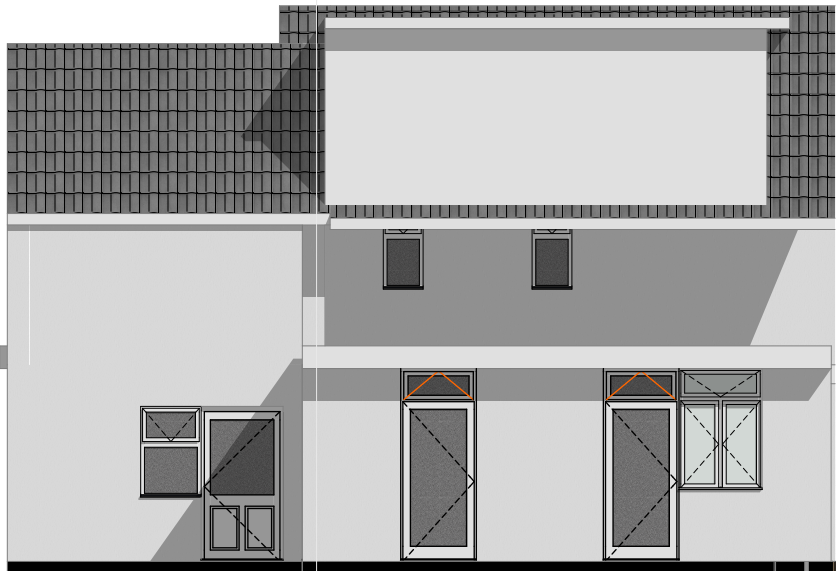
3 Existing Rear Elevation 1:100