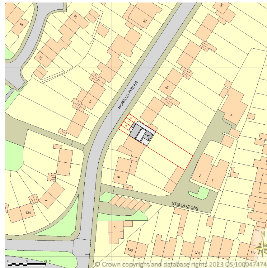
EXISTING SITE PLAN @ 1:1250

Covered bin store as shown (or similar), all waste hidden, and covered.