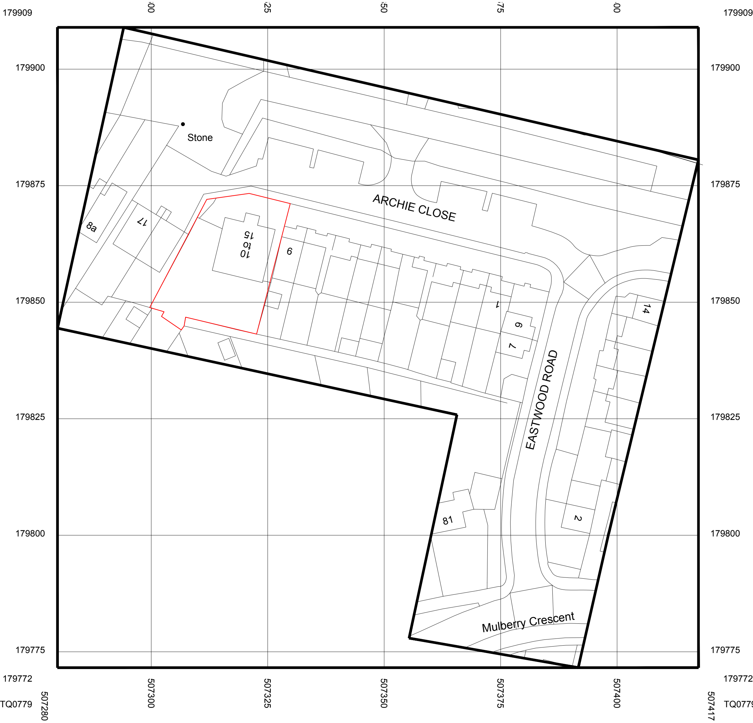
SITE BLOCK PLAN 1:500