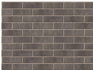
Grey brick to be "Bempton Grey" or similar from Marshalls Bricks and Masonry company or similar