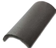
"Marley" concrete segmental ridge tile in smooth grey or similar