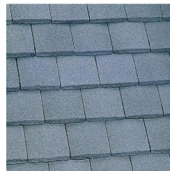
"Marley" plain roof tile and half smooth grey or similar

6 Stanley Road grey roof tile and ridge example