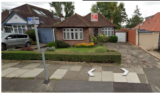
Image of existing forecourt plant arrangement. New forecourt to follow similar pattern/design. No vegetation to exceed 1.2m height to maintain a positive reciprocal relationship with the street, allowing for activation and natural surveillance.