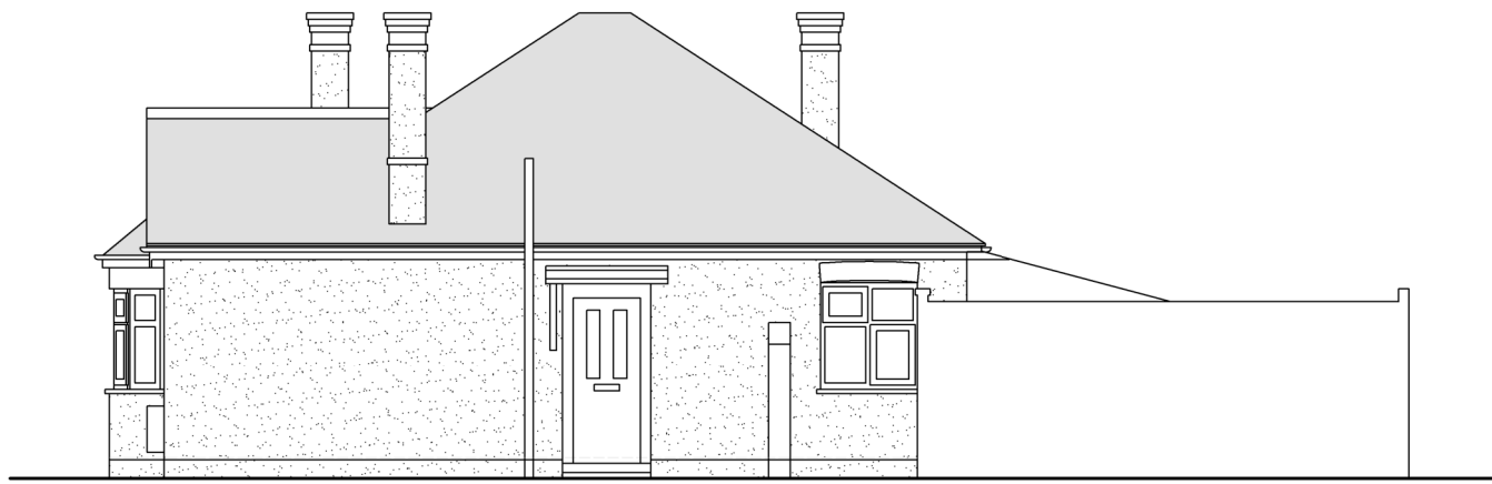
EXISTING DWELLING SIDE ELEVATION