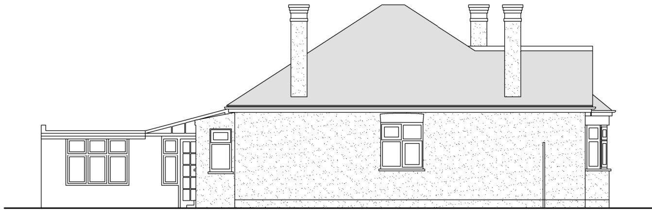
EXISTING DWELLING SIDE ELEVATION