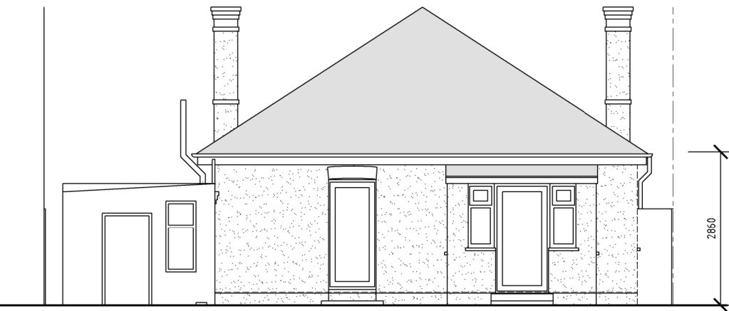
EXISTING DWELLING REAR ELEVATION