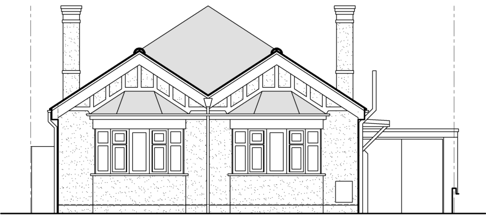
EXISTING DWELLING FRONT ELEVATION