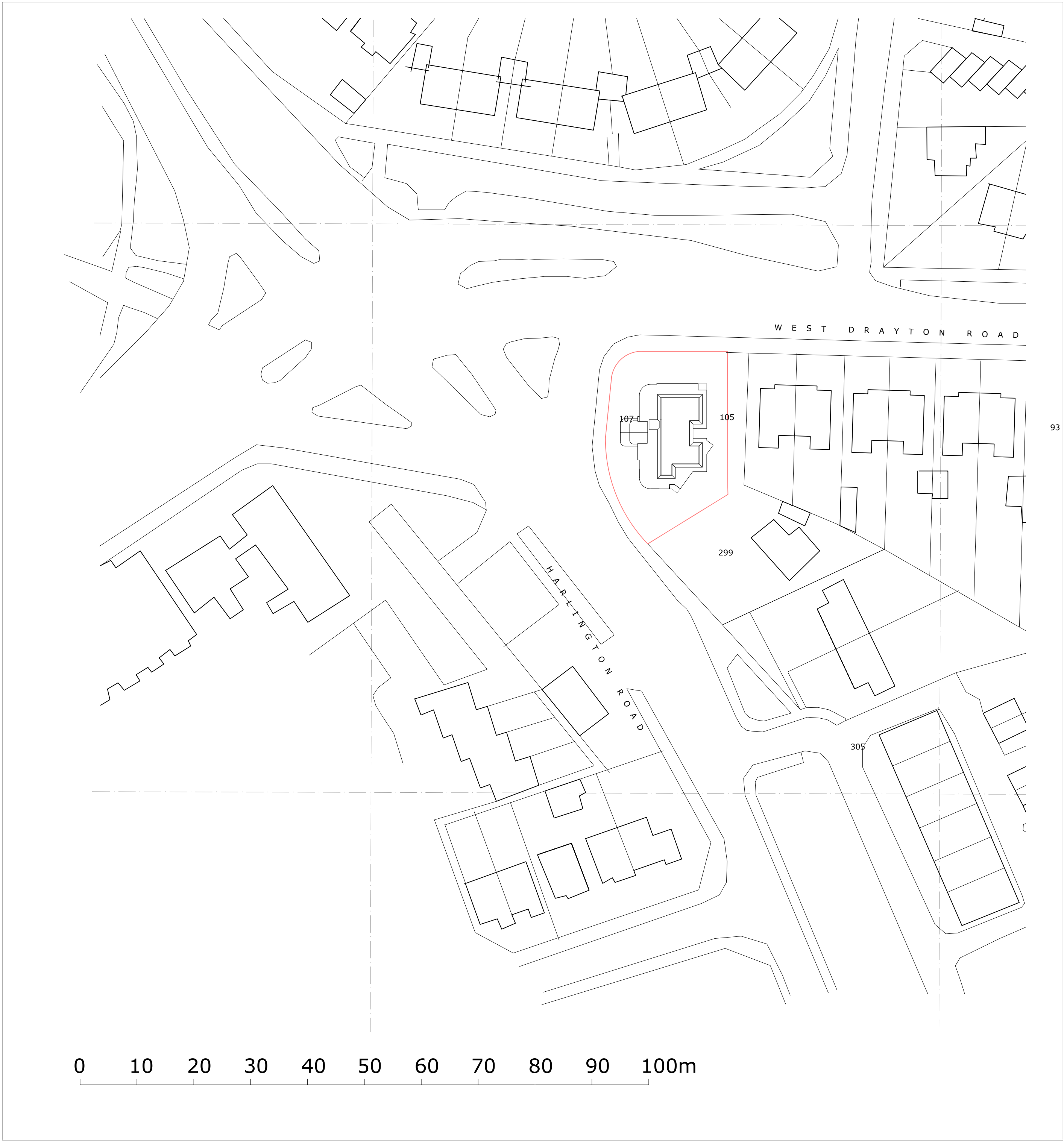
BLOCK PLAN. SCALE 1:500.