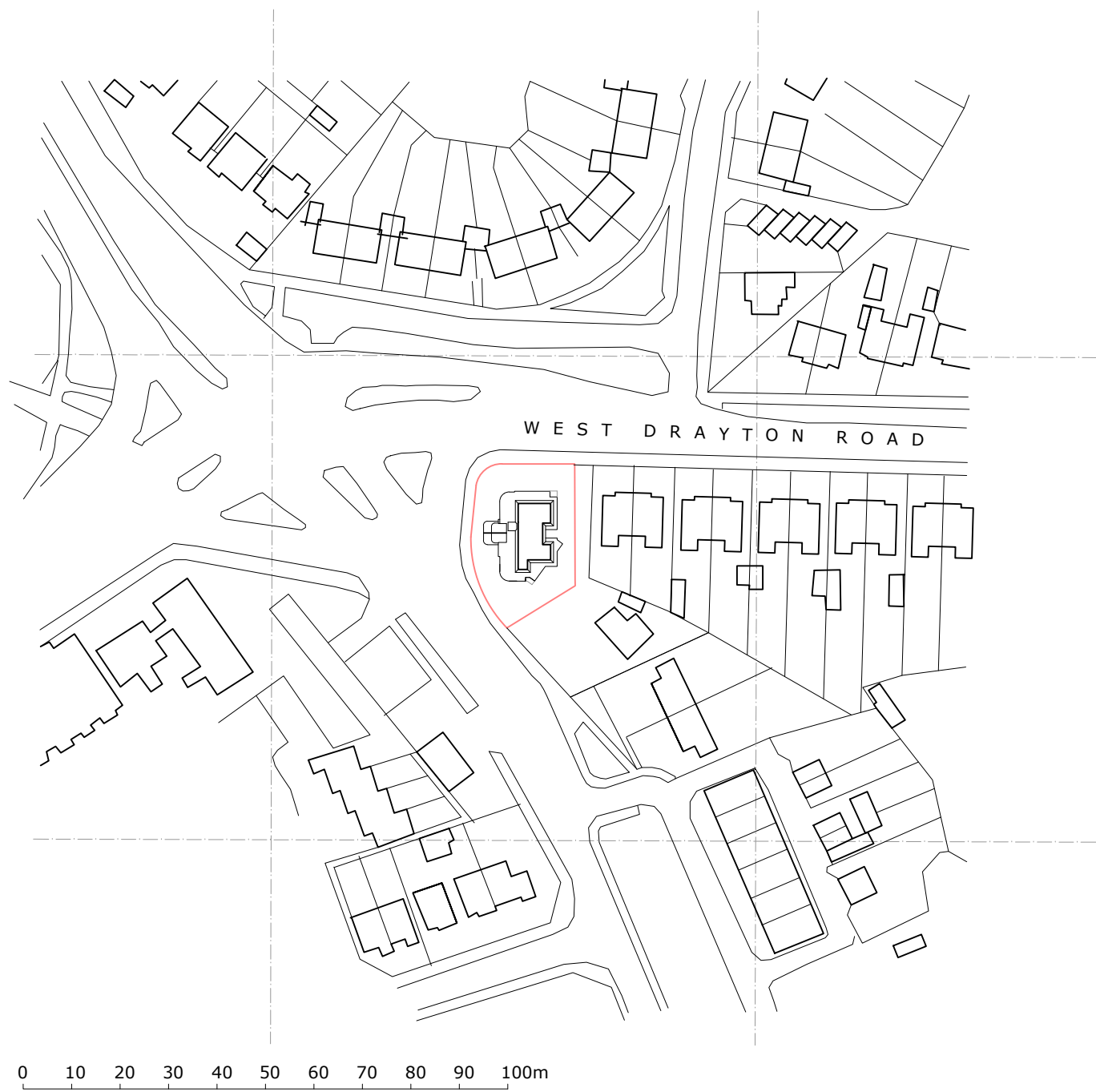
SITE LOCATION. SCALE 1:1250.