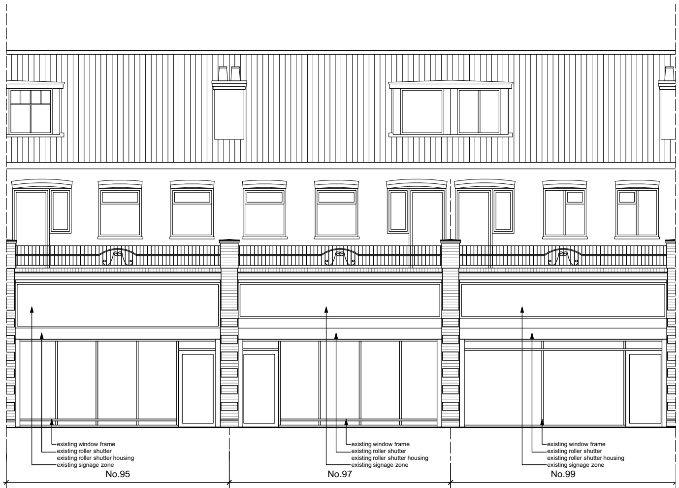
Existing Front Elevations (no changes are proposed)