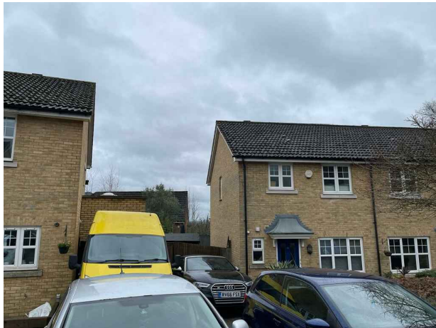
01 - FRONT VIEW