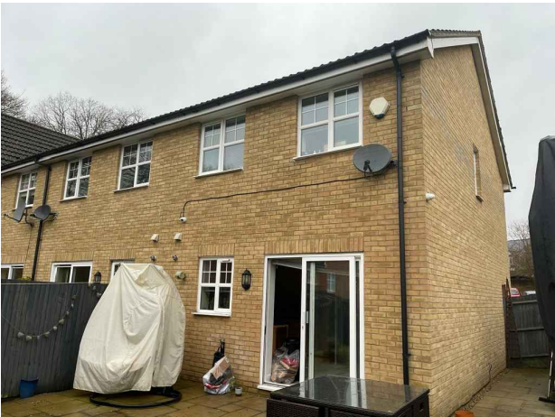
03 - SIDE VIEW