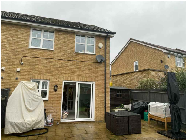
02 - REAR VIEW