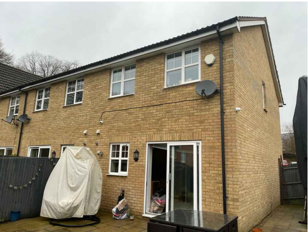
03 - SIDE VIEW