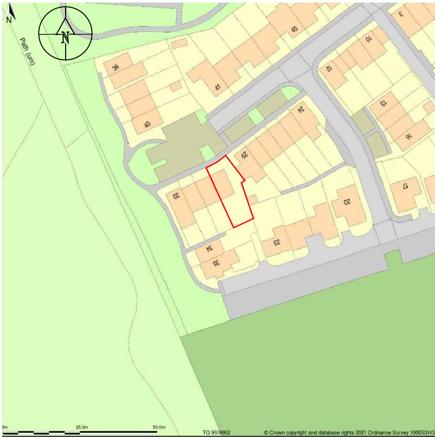
04 - OS MAP SCALE 1:1250