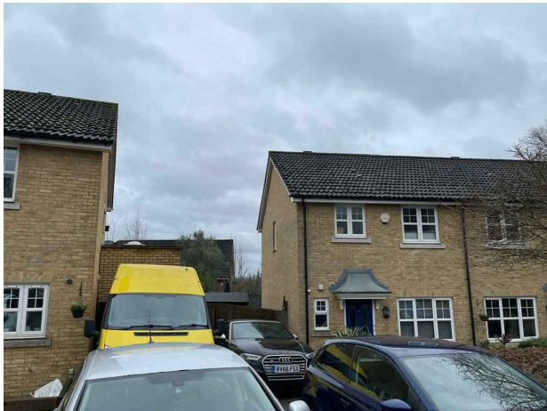
01 - FRONT VIEW