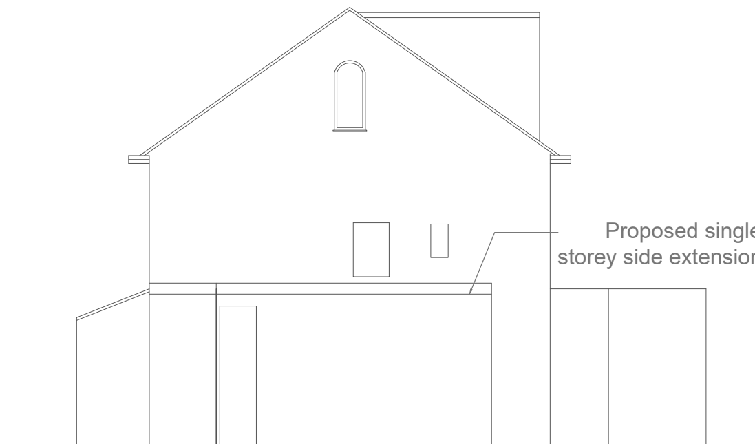
PROPOSED SIDE (SOUTH EAST) ELEVATION