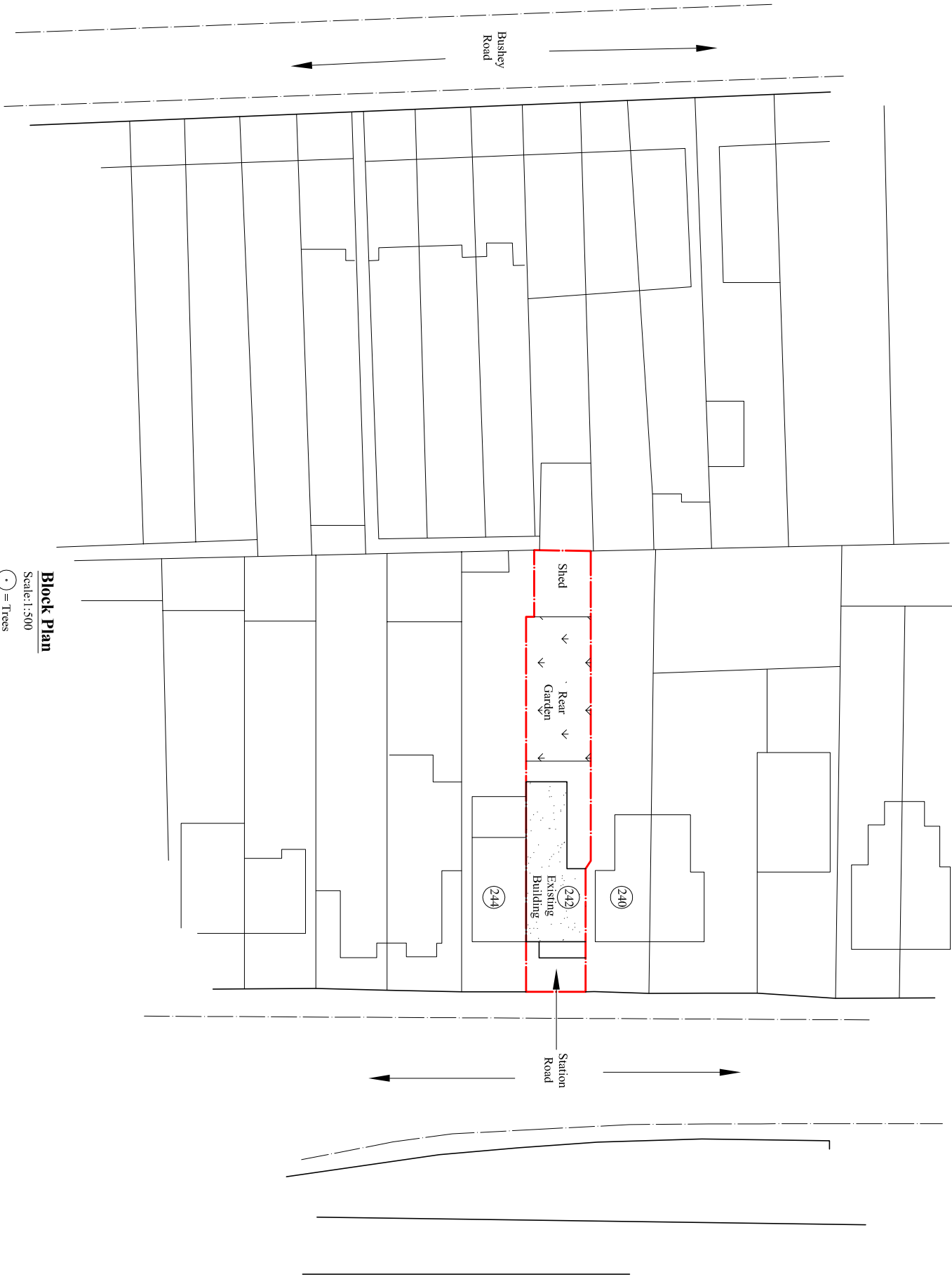
Block Plan Scale:1:500 = Trees