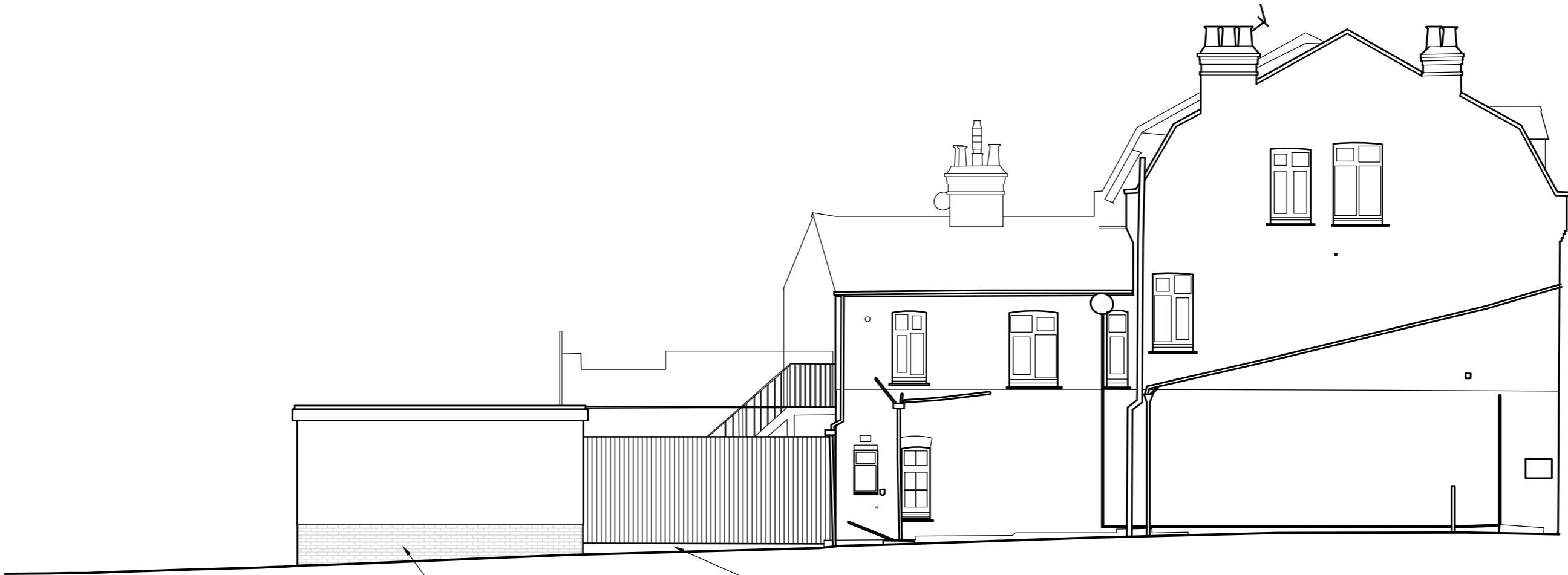
01 PROPOSED ELEVATION B-B (EAST) 1:100