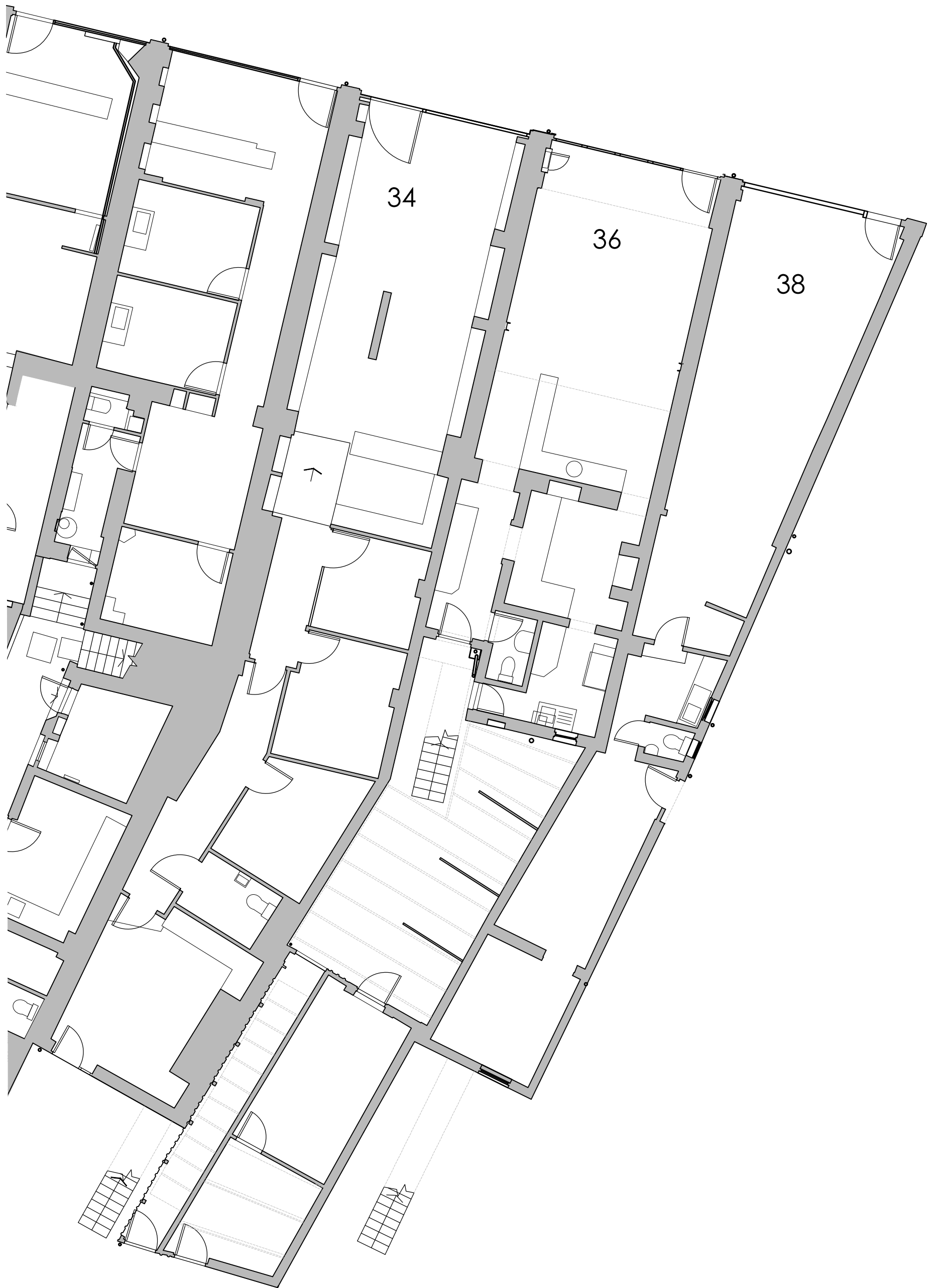
01 EXISTING GROUND FLOOR PLAN 1:100