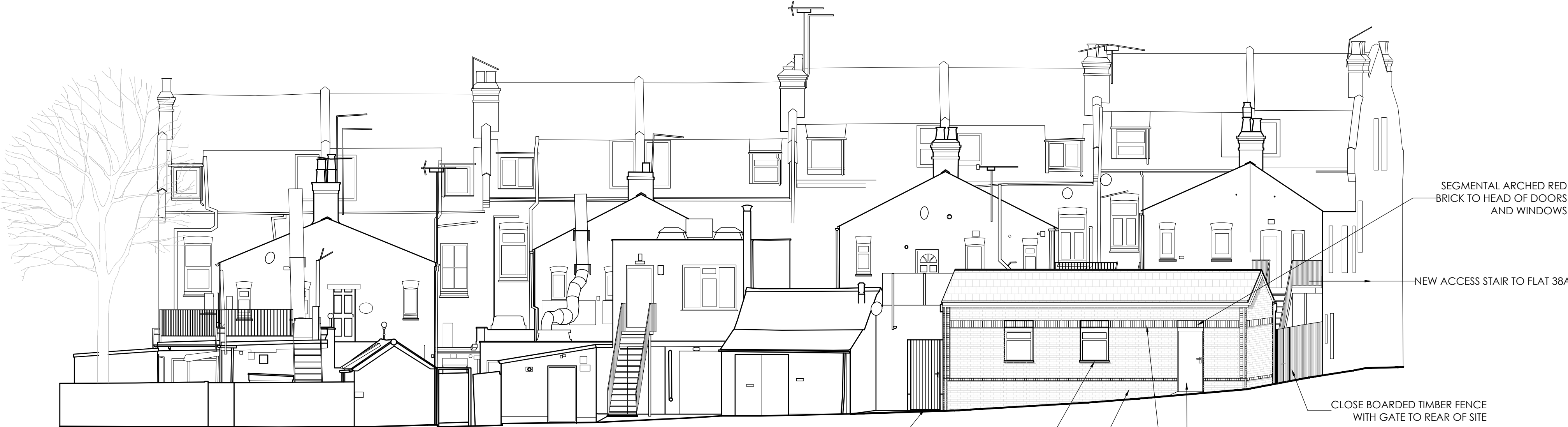
01 PROPOSED ELEVATION C-C (SOUTH) 1:100