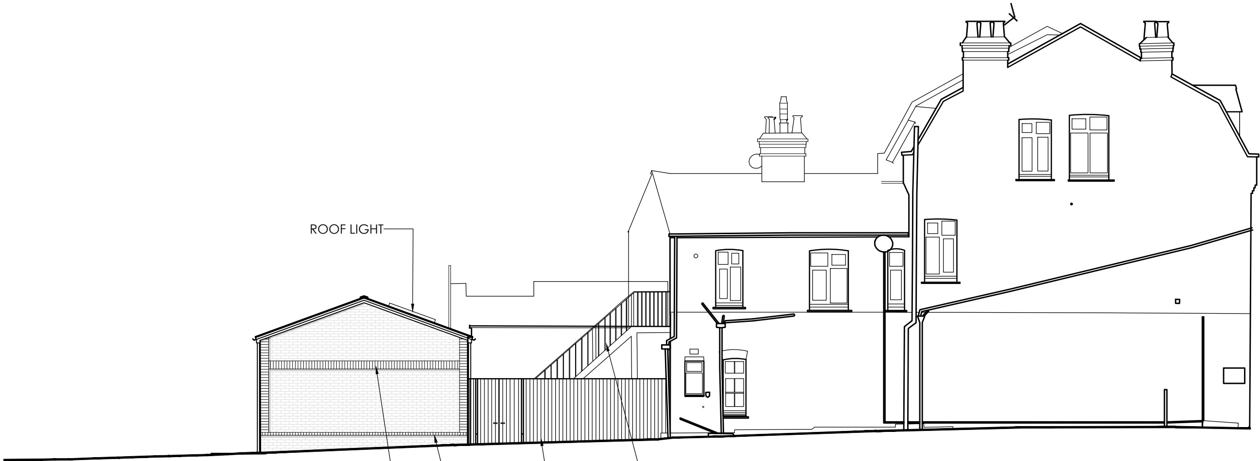
01 PROPOSED ELEVATION B-B (EAST) 1:100

NEW AND IMPROVED STAIR ACCESS TO RESIDENTIAL UNITS