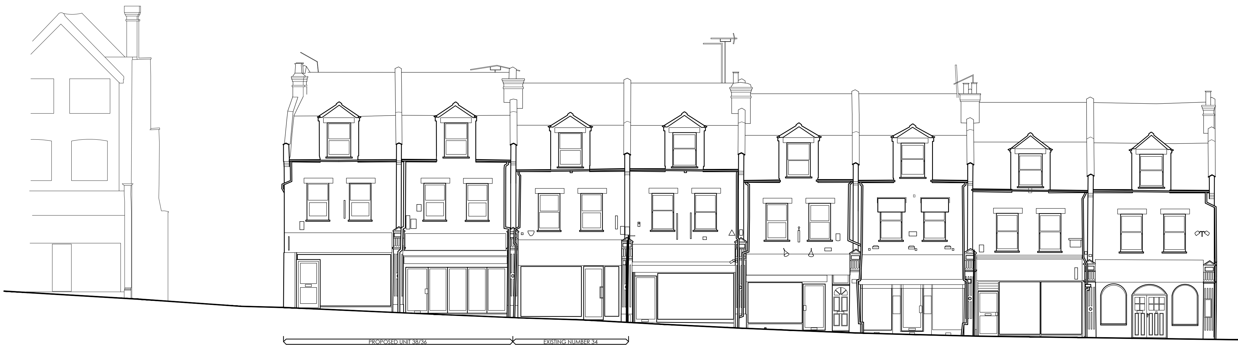
01 PROPOSED ELEVATION A-A (NORTH) 1:100

UNIT 38, 36 & 34 SHOPFRONT TO REMAIN AS EXISTING AND REPAINTED WHITE