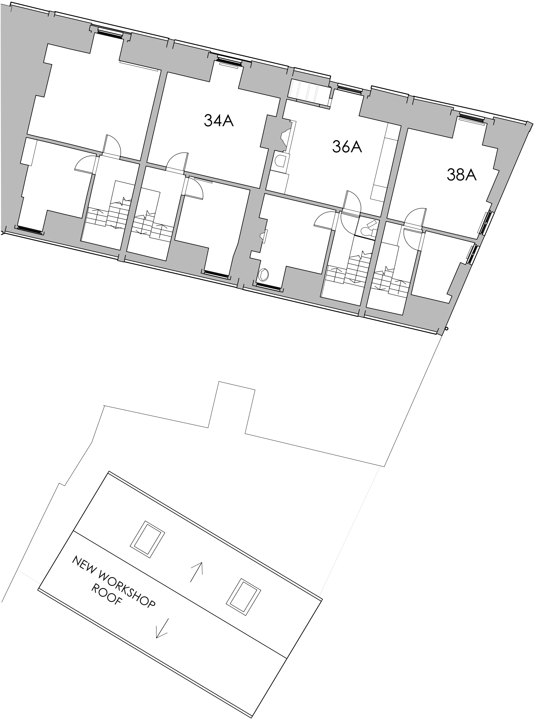
01 PROPOSED SECOND FLOOR PLAN 1:100