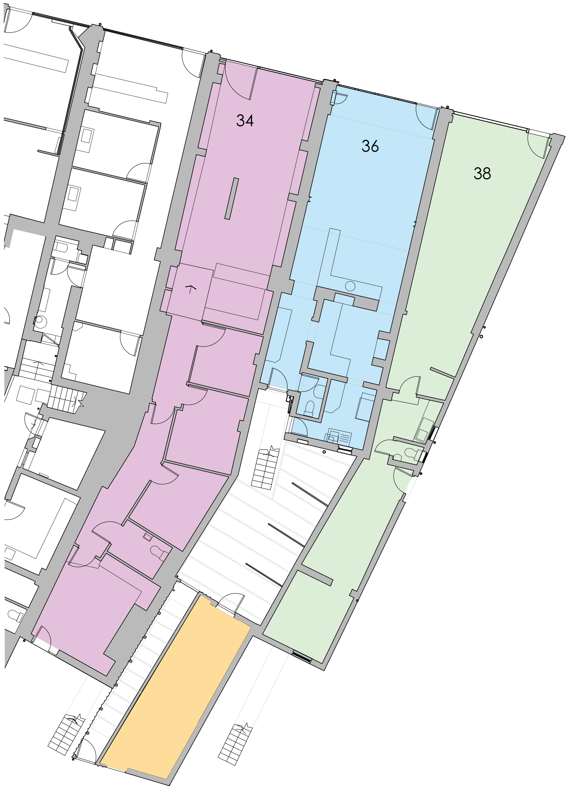
01 EXISTING GROUND FLOOR PLAN 1:100