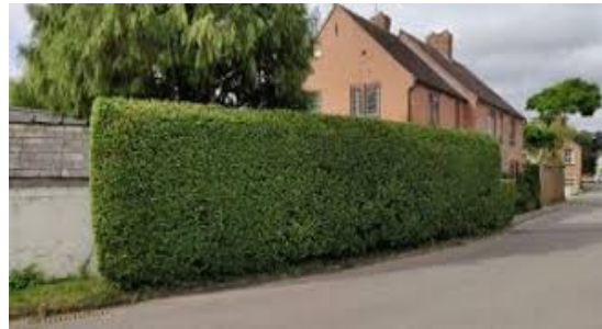
EXAMPLE BOUNDARY HEDGE