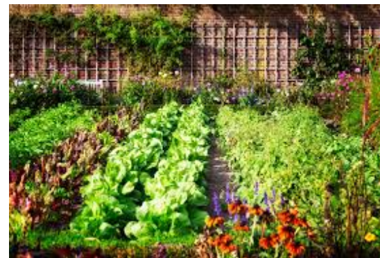
EXAMPLE VEGETABLE GARDEN