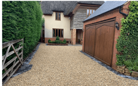
EXAMPLE SHINGLES DRIVEWAY