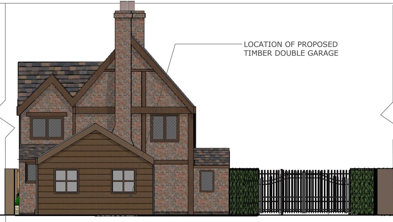
PROPOSED ELEVATION B-B SCALE 1:100 @ A3