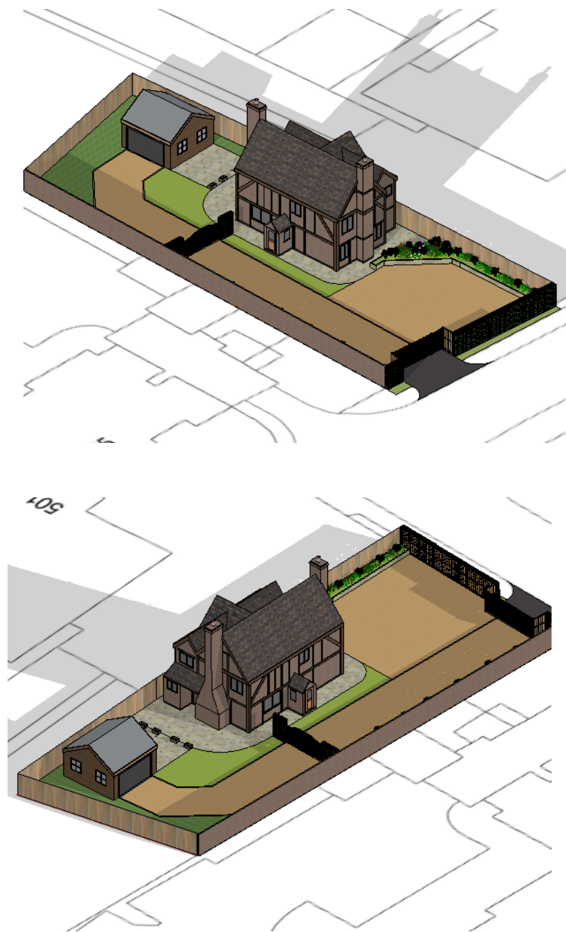
PROPOSED 3D SITE IMAGES