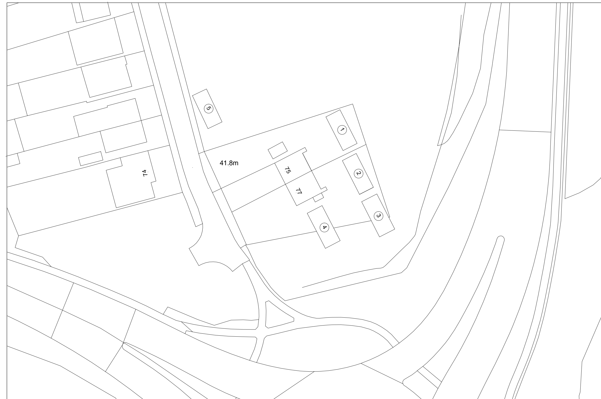
SITE PLAN (SCALE 1:500)