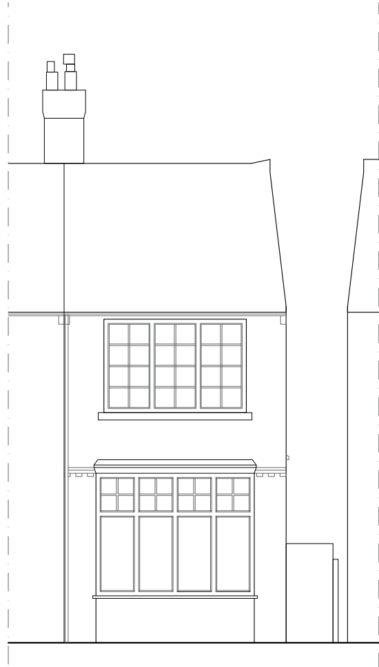
Front Elevation - Existing