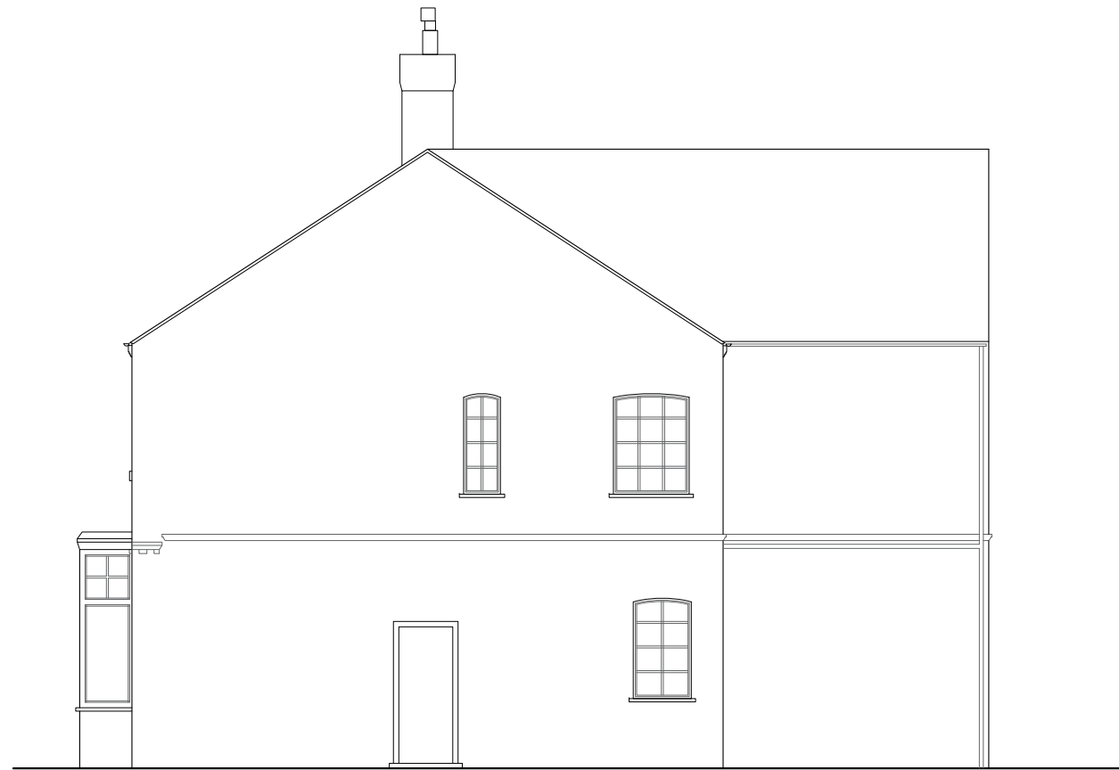
Side Elevation - Existing