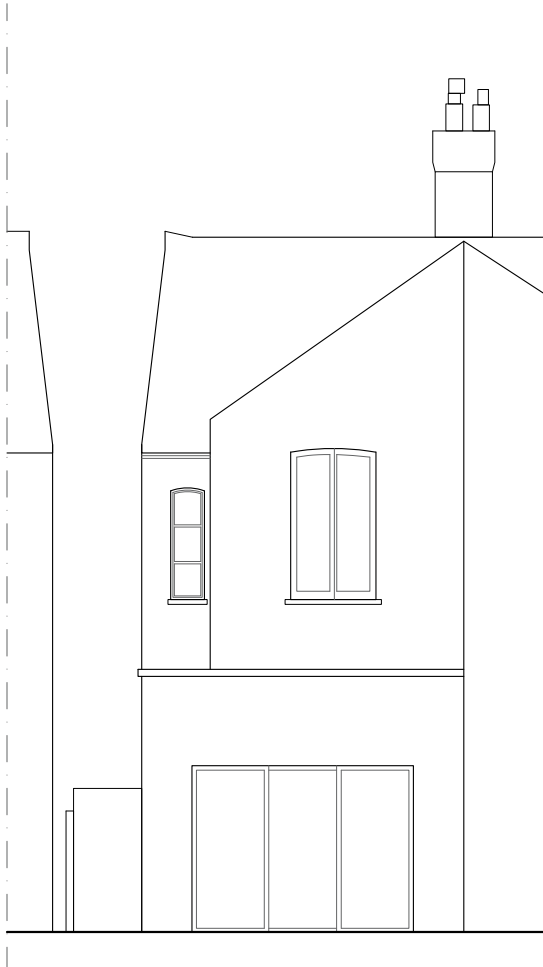
Rear Elevation - Proposed