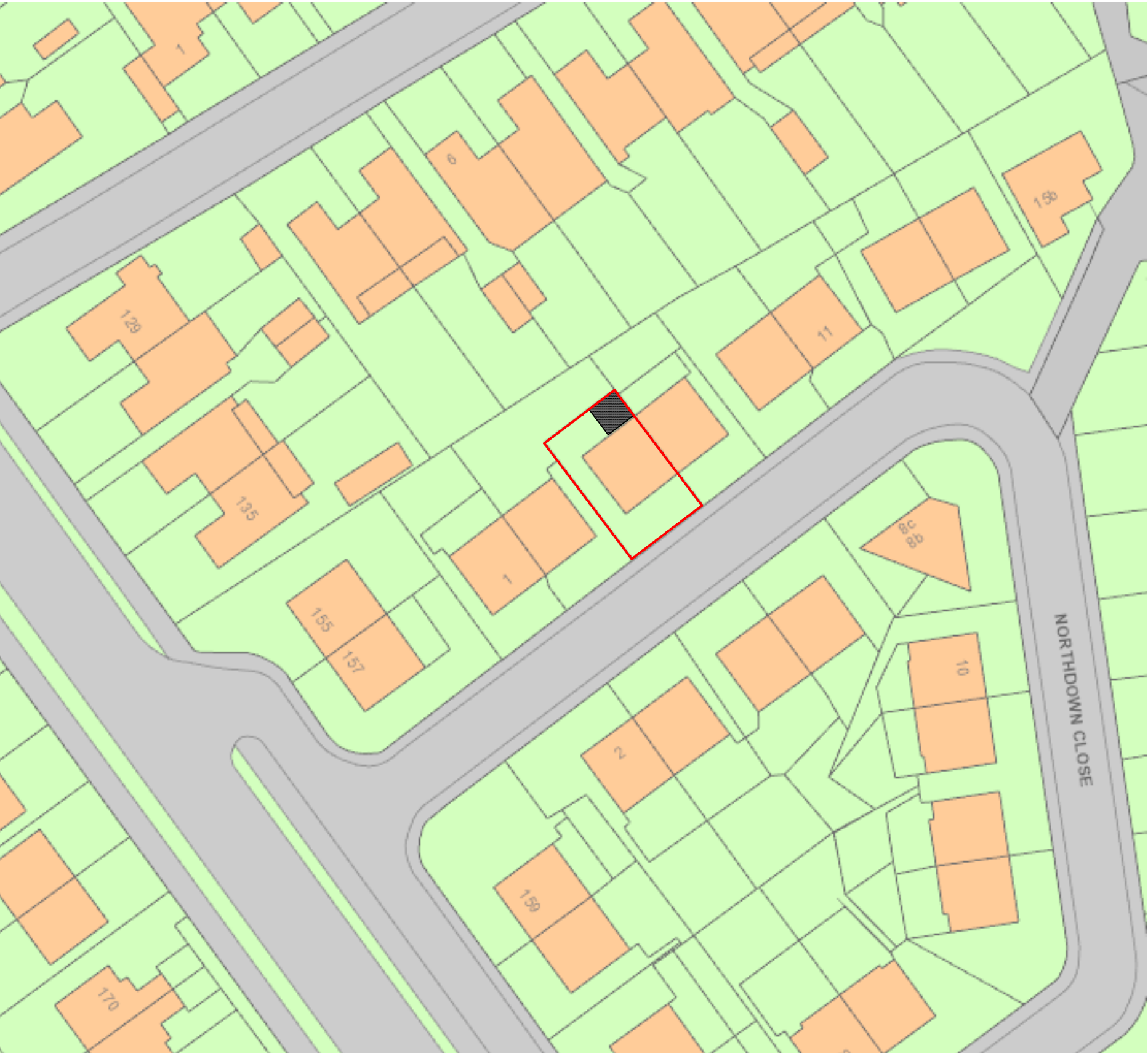
BLOCK PLAN 1:500

Drawings to be read in conjunction with relevant drawing and specs. Drawings not to be scaled, figured dimensions only. Any discrepancies are to be pointed to the Agent/Engineer/Contractor. The Agent is not liable for any faults not raised. Drawings not to be scaled for land transfer purposes