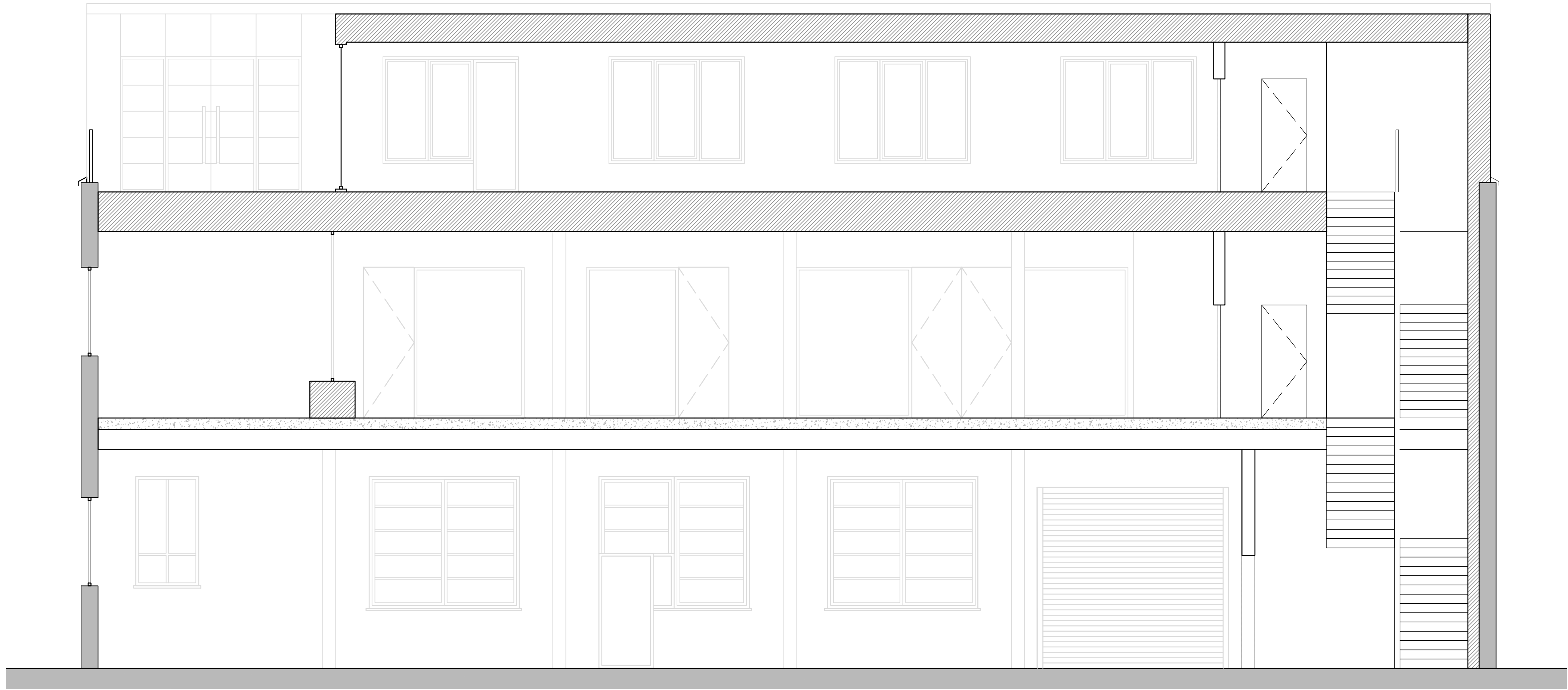
PROPOSED SECTION B-B' SCALE - 1:50 @ A1