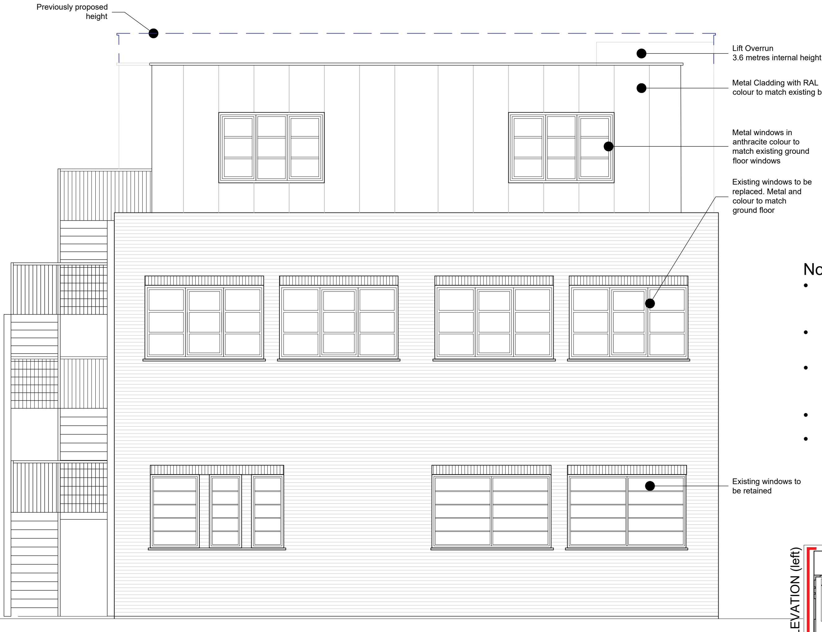
PROPOSED SIDE ELEVATION (left)