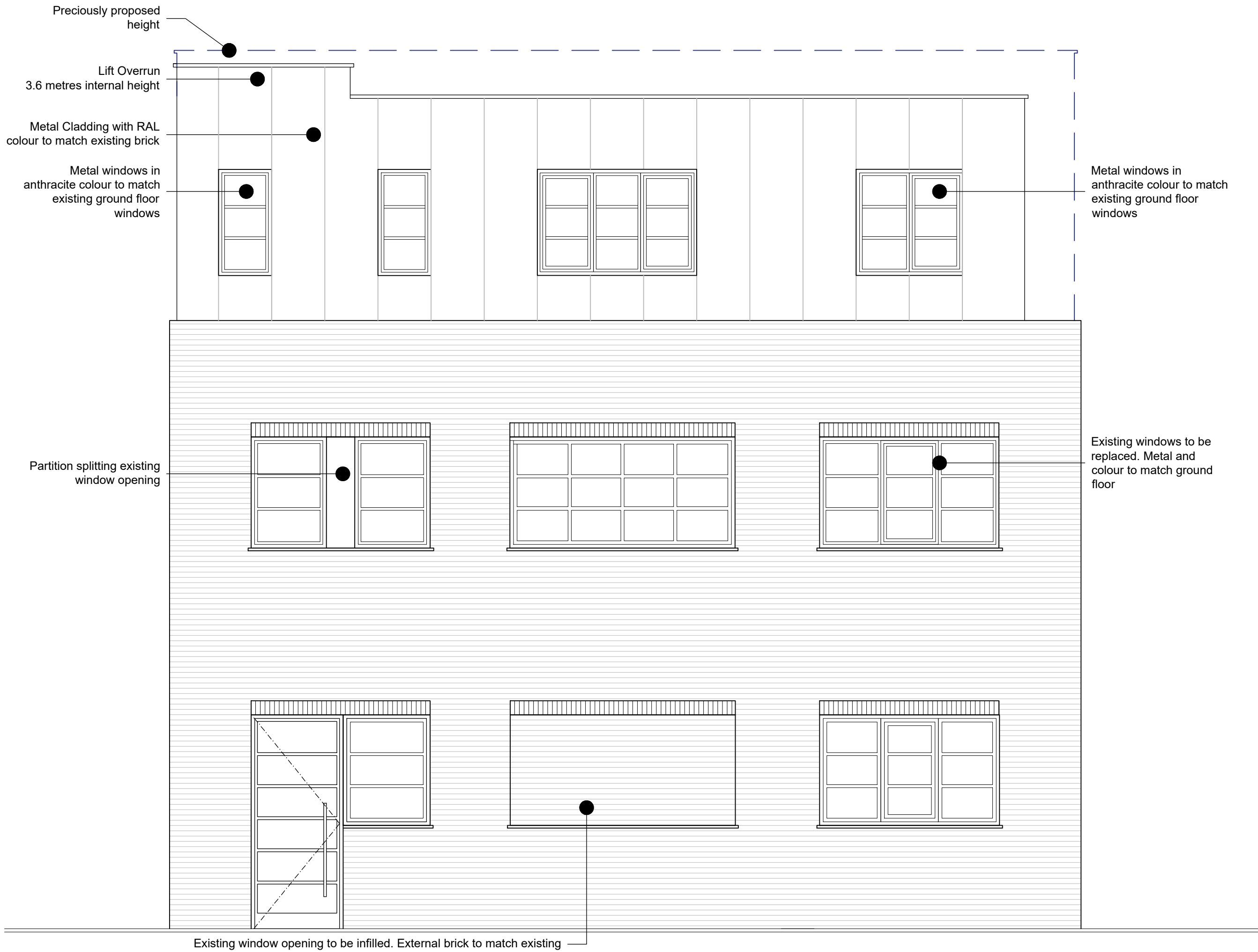
PROPOSED SIDE ELEVATION (right)